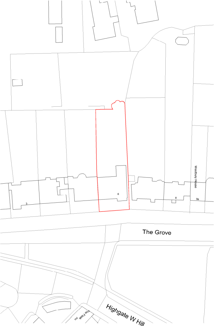
2 Site Location Plan 1:1250