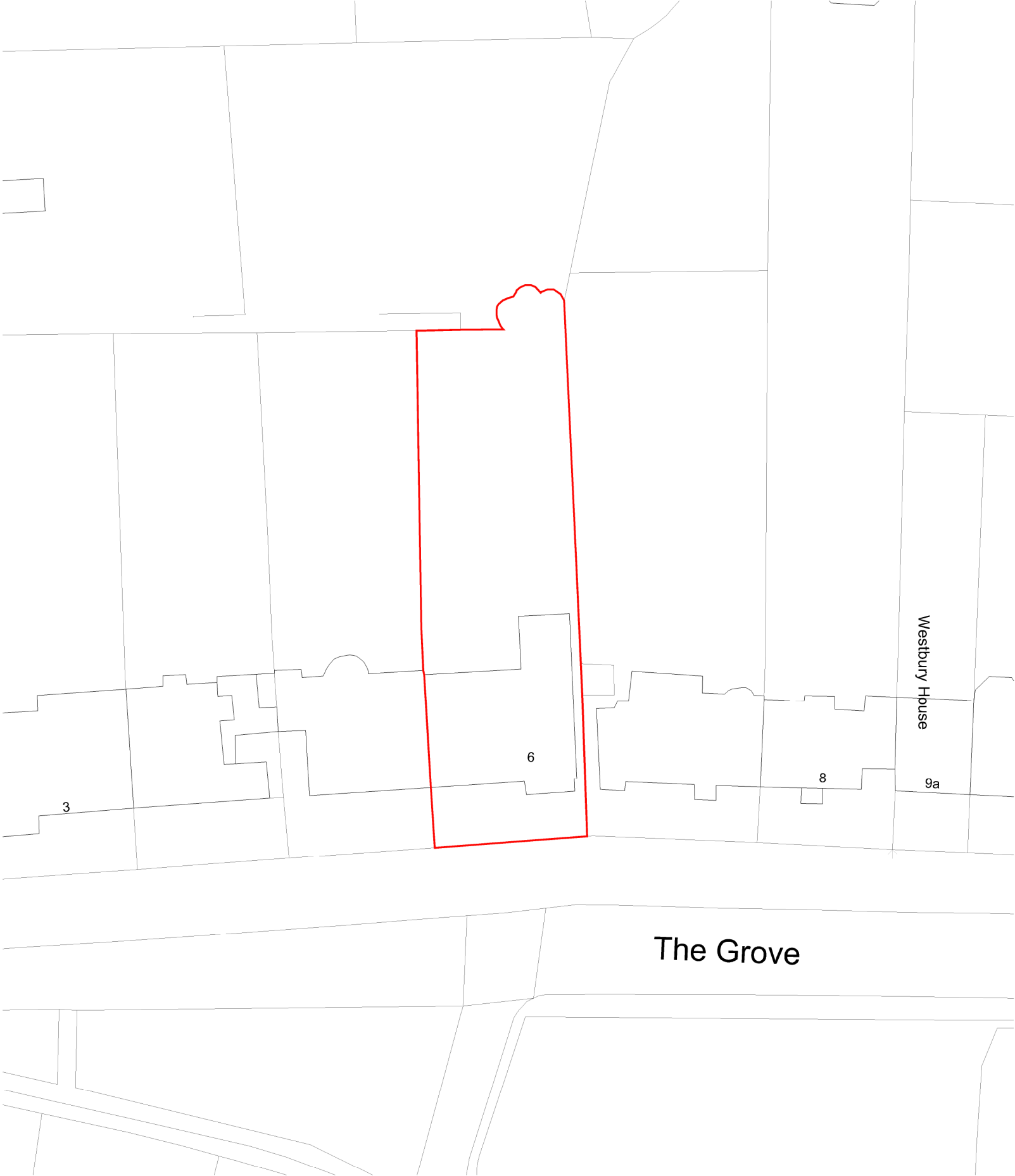
1 Block Plan 1:500