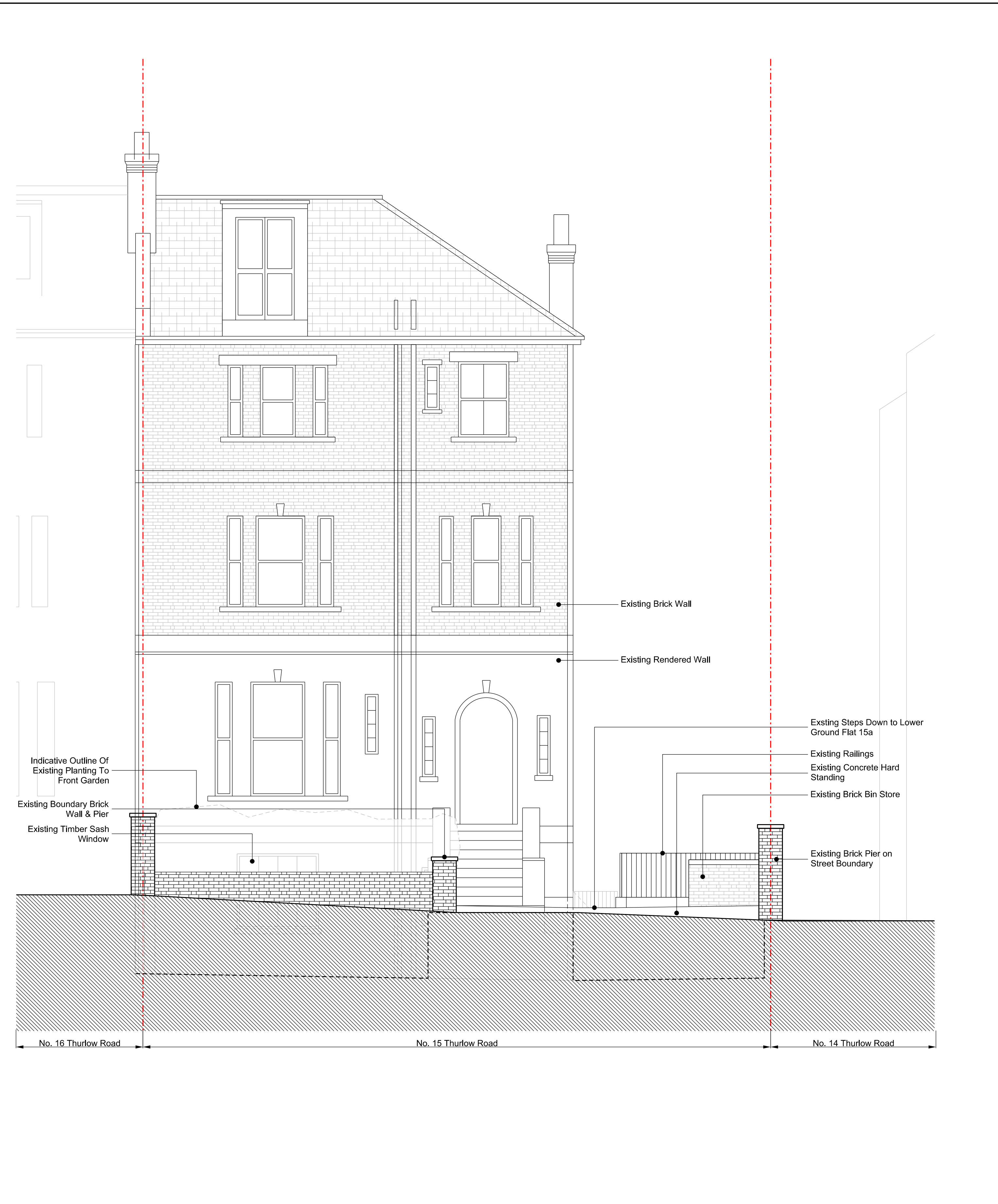
01 EXISTING: FRONT ELEVATION