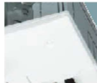
Motion Sensor (Option)

4 additional flaps are to be controlled individually at each operation mode. They change air flow direction and prevents draft feeling. This new function also achieve more flexible control for air flow direction.