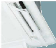
Draft Prevention Panel (Option)

4 additional flaps are to be controlled individually at each operation mode. They change air flow direction and prevents draft feeling. This new function also achieve more flexible control for air flow direction.