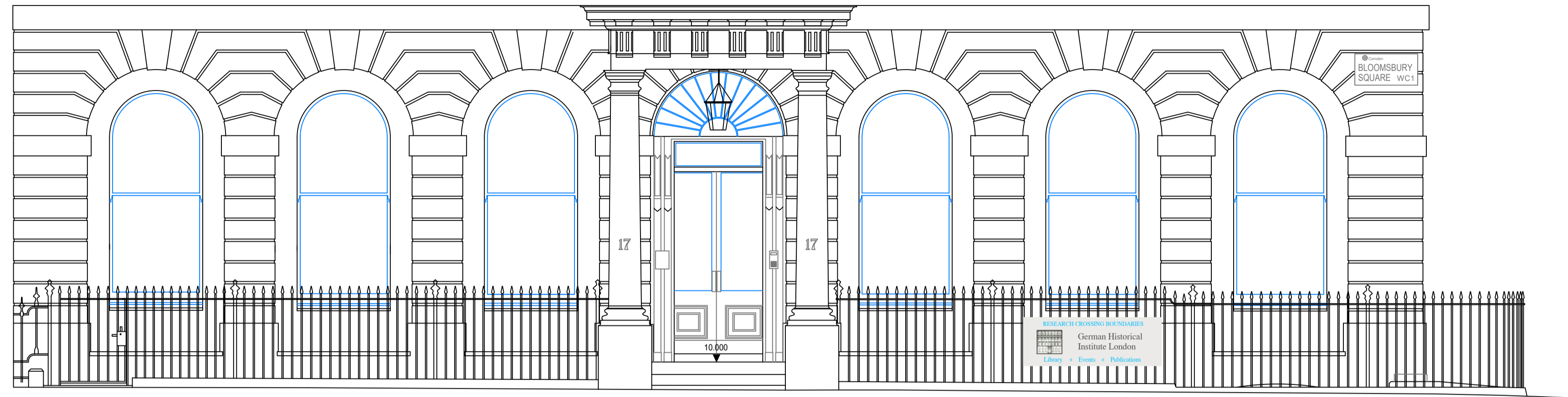
Elevation A No.17 Bloomsbury Square

Elevations A & B (without Banner) 10636.01 Elevations A & B (with Banner) 10636.02