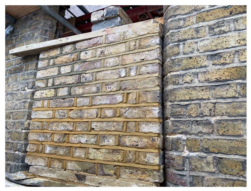
Sample brickwork panel using original bricks built between existing/retained facade showing four samples of pointing - proposed choice of pointing is labelled 'M4 Y35

Application for Approval of Condition: 2019/4859/P