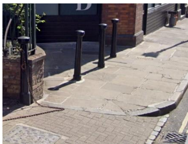
2 Photo of flush transfer from Tower Street to Tower Court