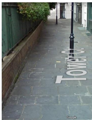
2 Photo showing flush paving along Tower Court