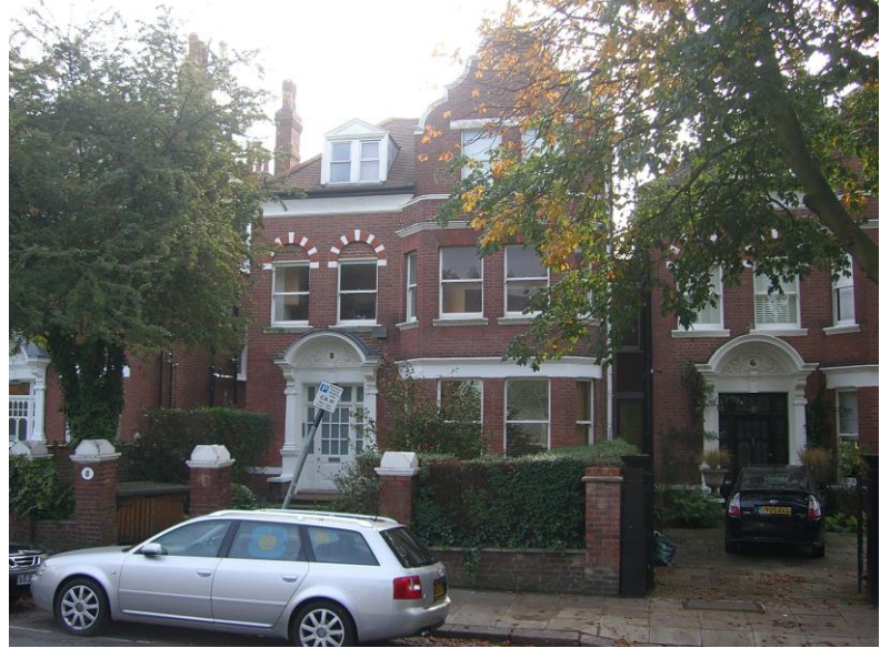
Photo B: View of the front elevation of the application from Frognal Lane