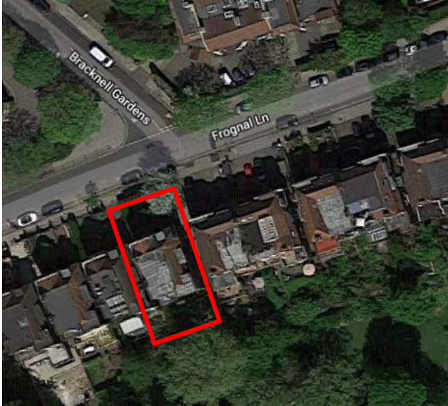
Photo A: Aerial view of the application site and surrounding properties