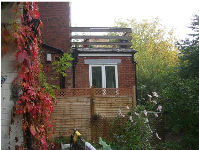
Photo C: View from existing rear terrace towards rear extension of no 10 Frognal Lane