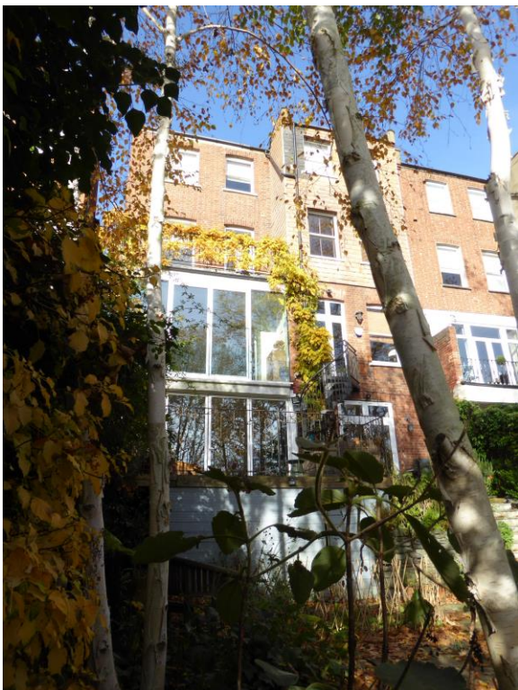
Photo G: View of the rear elevation to the neighbouring property at no. 6 Froggnal Lane