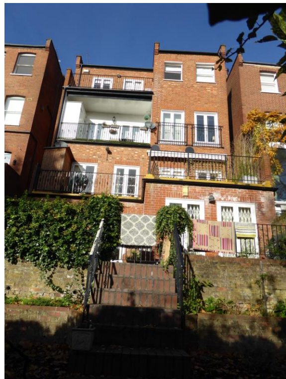
Photo H: View of the rear elevation to the neighbouring property at no. 4 Froggnal Lane