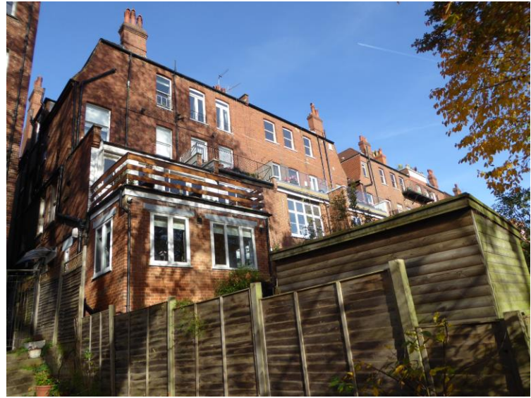
Photo F: View of the rear elevation to the neighbouring property at no. 10 Froggnal Lane