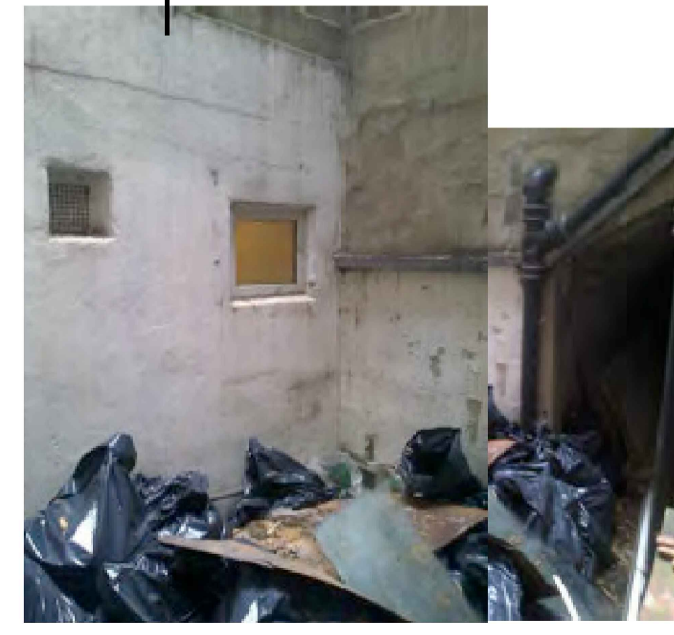
IMAGE OF EXISTING LIGHTWELL