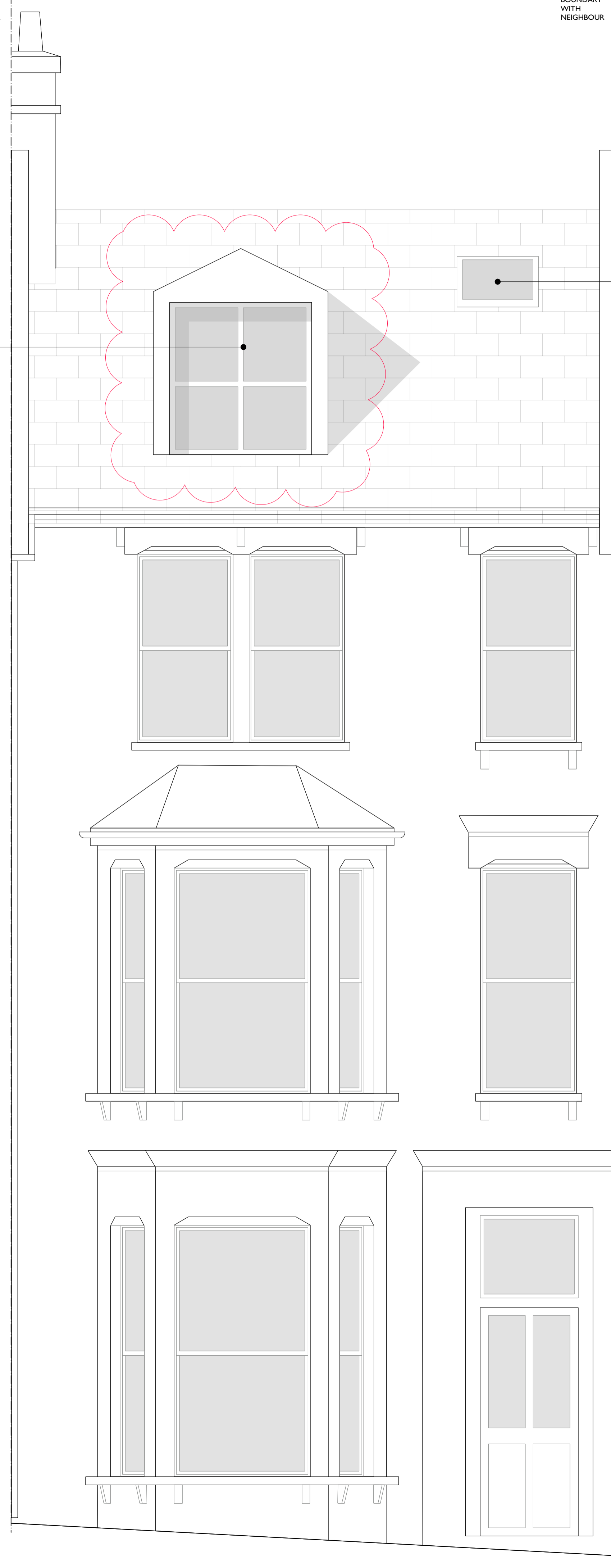
1 PROPOSED NORTH ELEVATION

PROPOSED ROOFLIGHT PREVIOUSLY CONSENTED UNDER APPLICATION NO. 2018/2450P