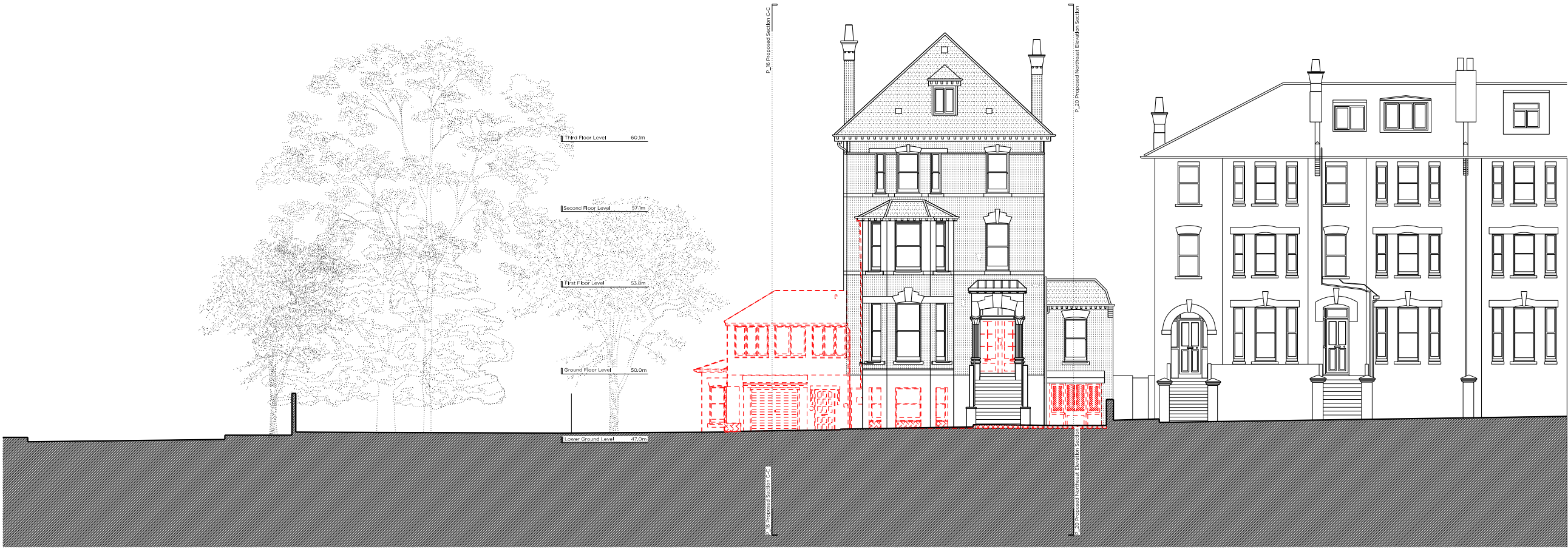
Demolition Southeast Elevation