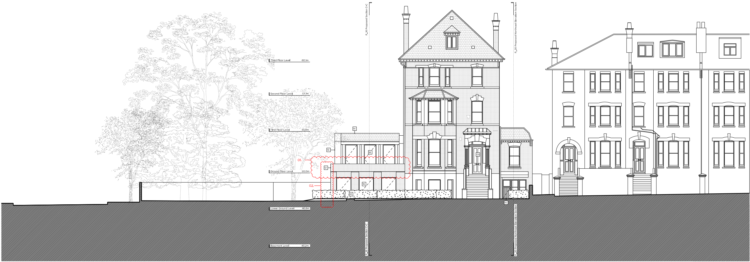
Proposed Southeast Elevation