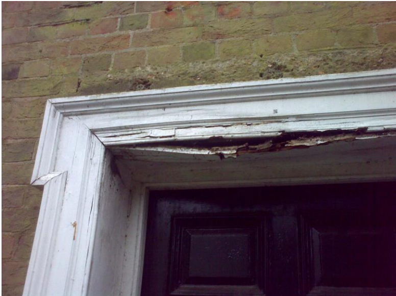
Fig 4 Decayed Entrance door surround