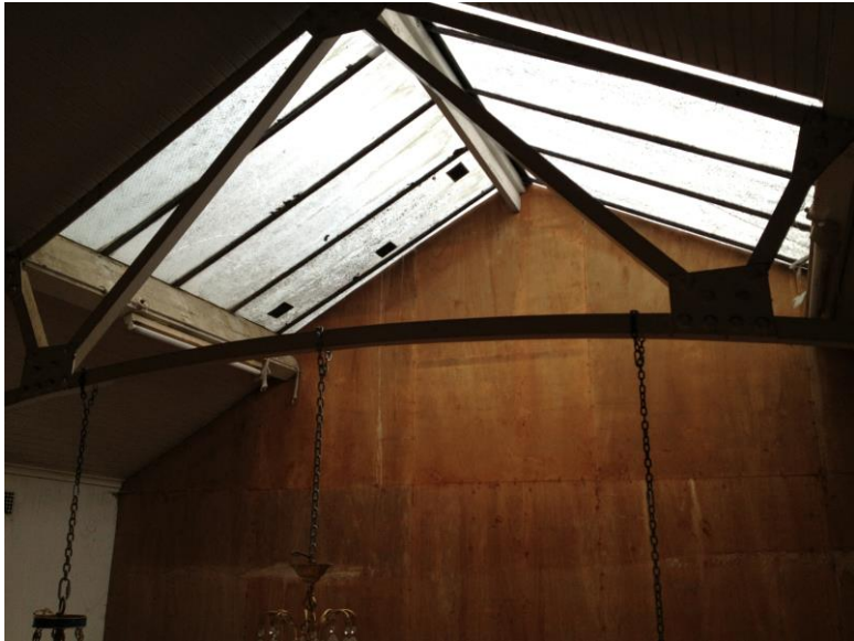
Fig. 2 Dividing wall in former squash court.