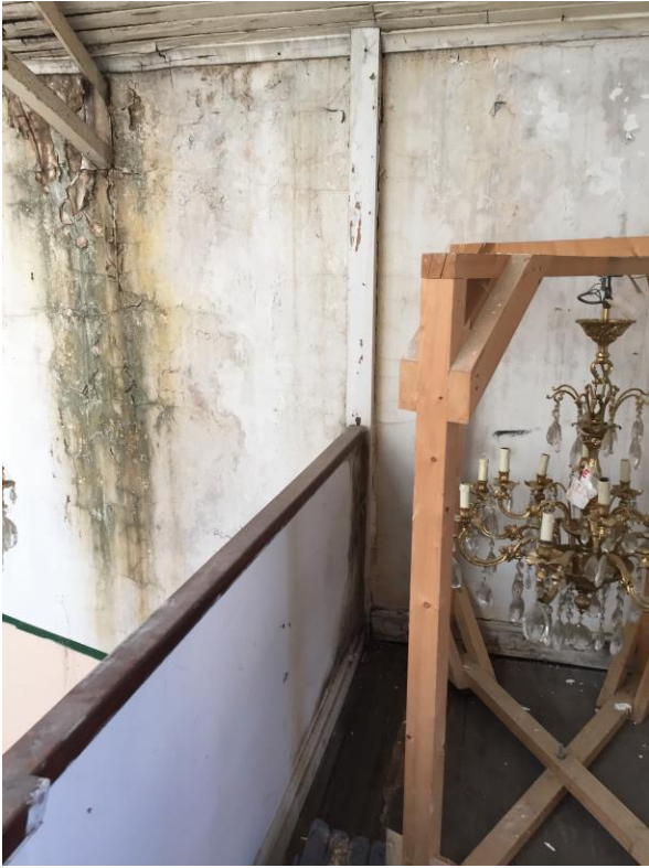
Fig. 10 Damage evident from leaking parapet gutter.