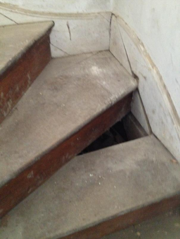
Fig. 45 Defective timber stair treads (Nov 15).