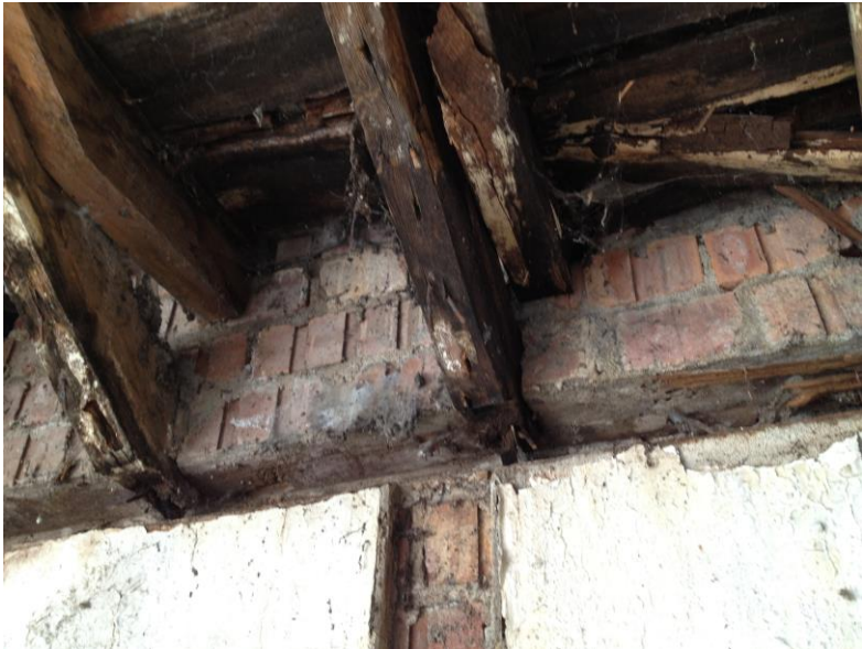
Fig. 43 Decayed wall plate, rafter feet and gutter lining (April 16).