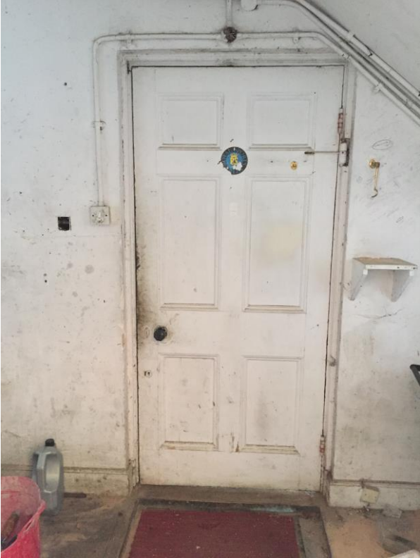
Fig. 46 Panelled entrance door & surface run conduits (Nov 15).