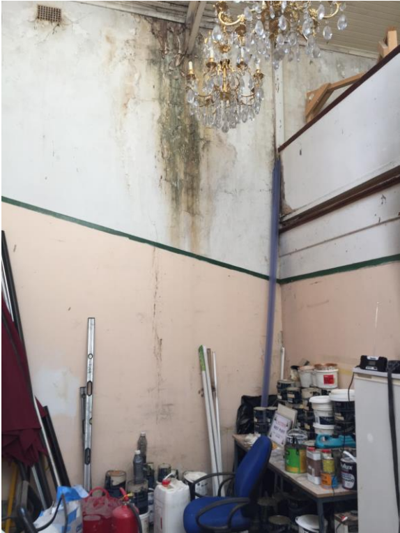
Fig. 14 Squash Court (Nov 15).