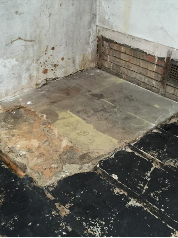
Fig. 19 Area of patched flooring in NE corner.