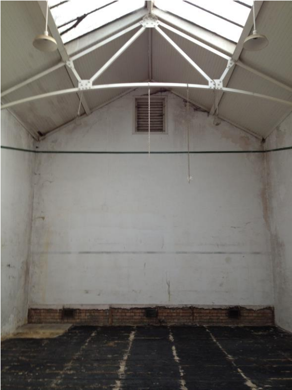
Fig. 18 View looking east following asbestos removal (Dec 15).