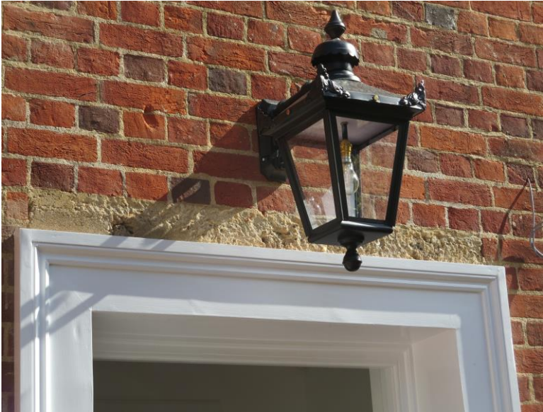
Fig. 39 Replacement cast iron lantern over entrance door (July 16).