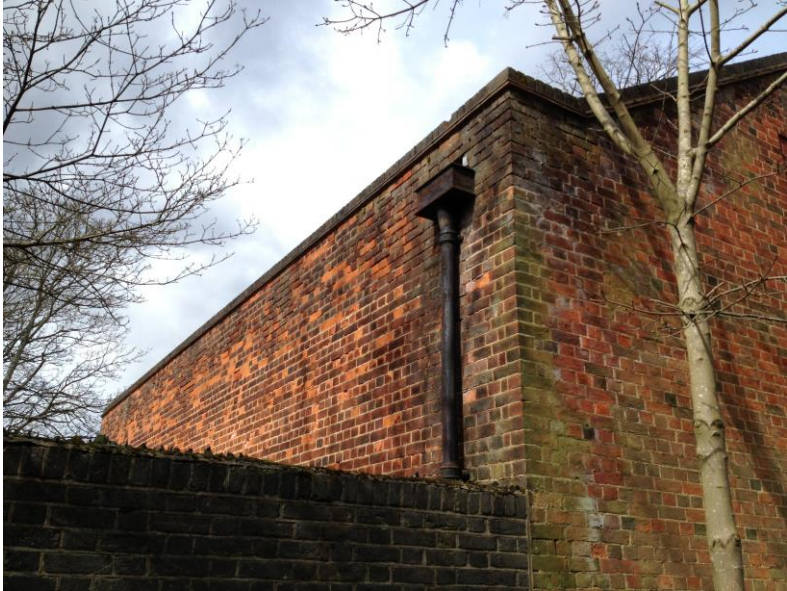
Fig. 27 South elevation from Fitzroy Park