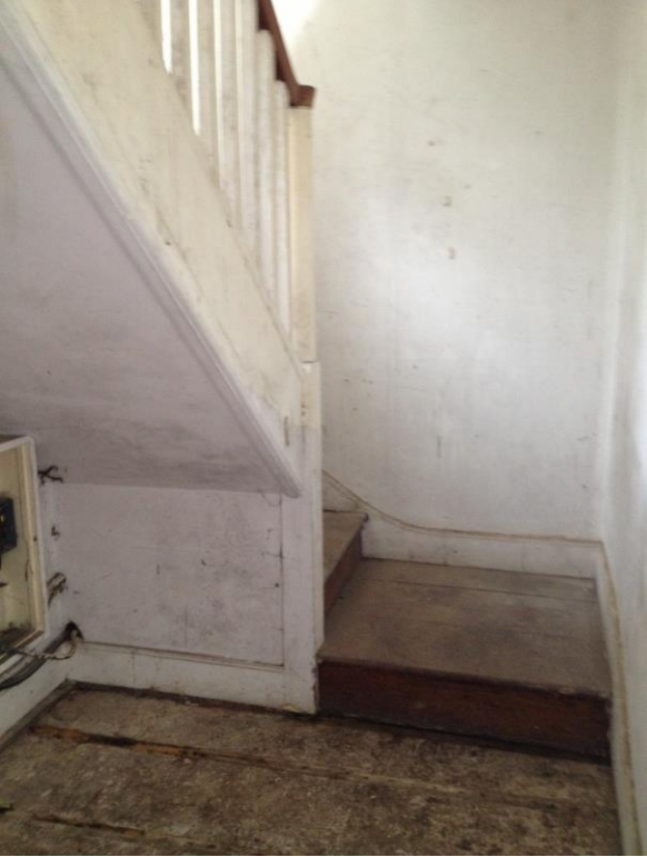
Fig. 44 Access stair to viewing gallery (Dec 16).