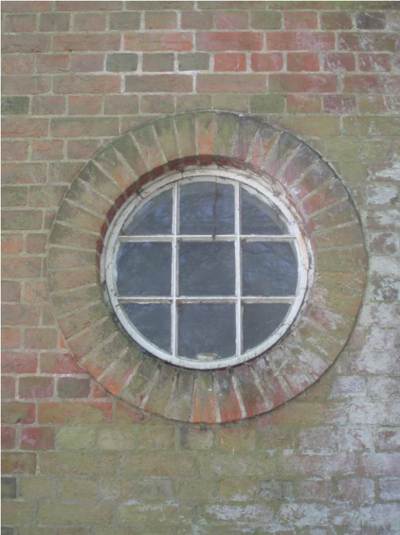
Fig 35. Corroded and 'seized' Bullseye window