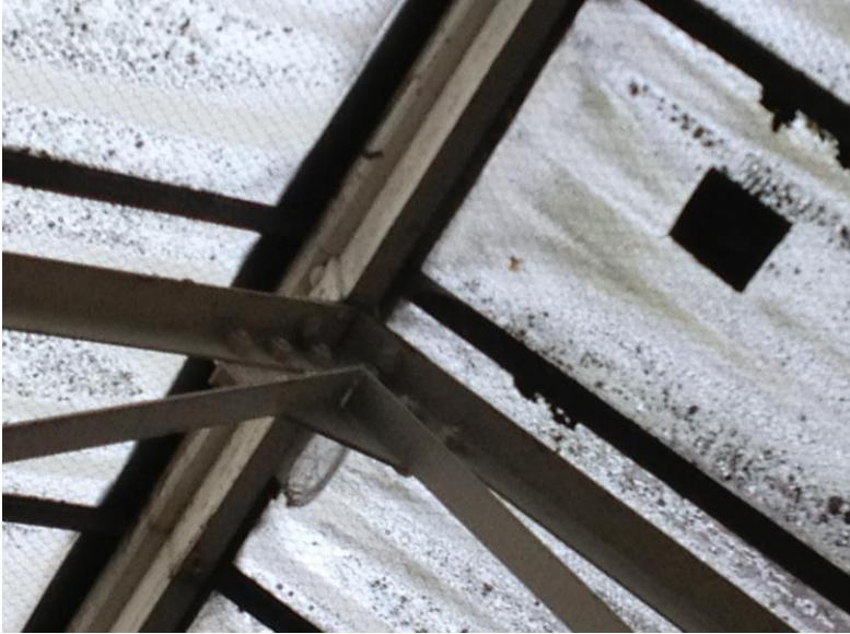
Fig. 6 Detail of roof structure.