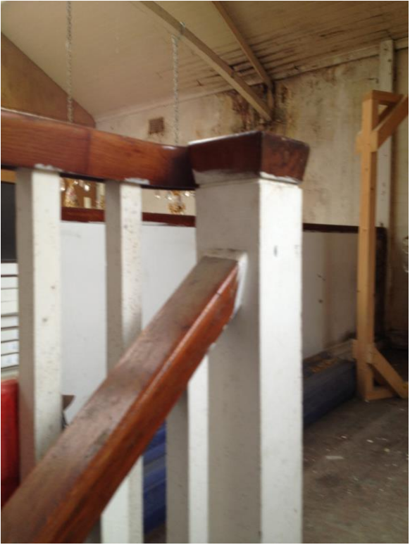
Fig. 16 Gallery and access stair.