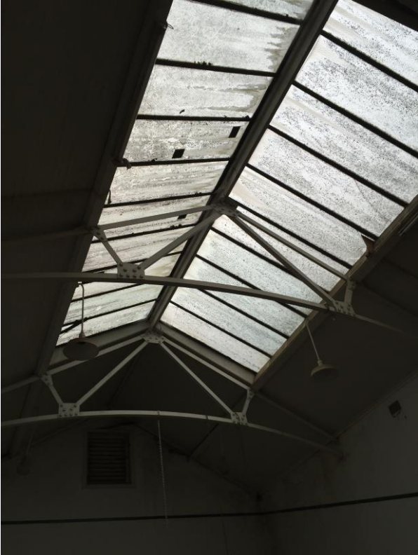
Fig. 5 Cracked & patched single glazed roof light.