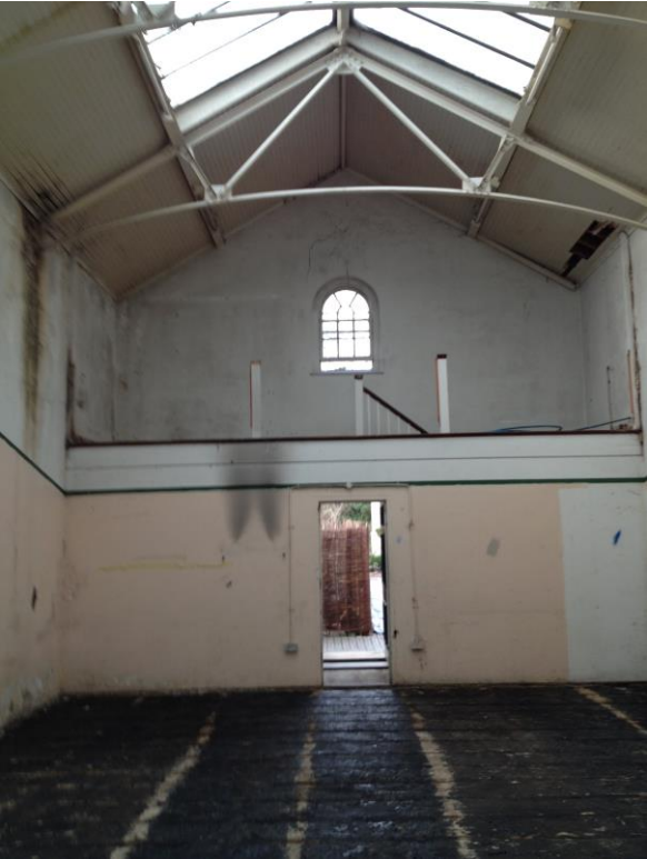
Fig. 20 View looking west following asbestos removal (Dec 15).