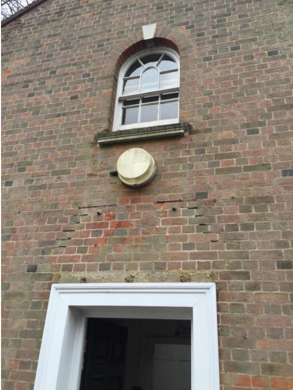
Fig. 38 Bulkhead light fitting and former canopy outline (Dec 15).