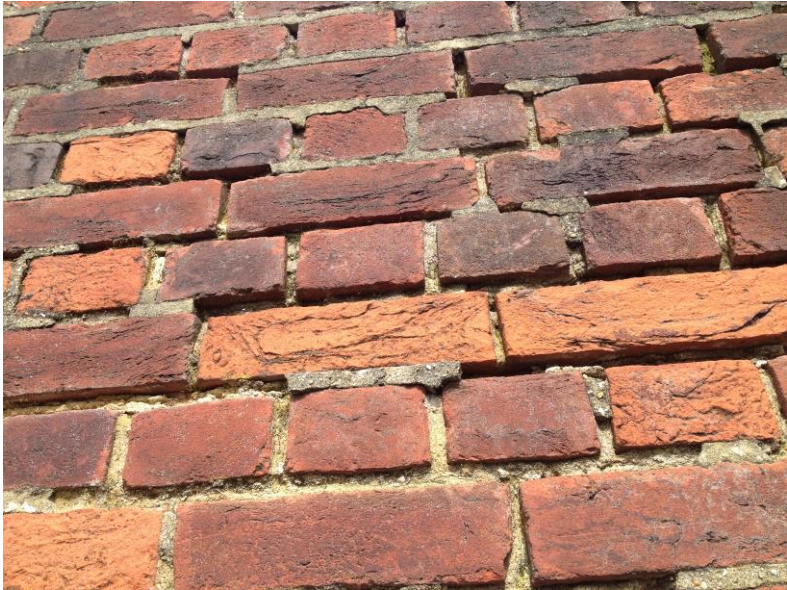
Fig. 31 Detail of weathered brickwork pointing.