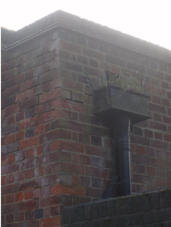
Fig. 7 Weathered parapet and defective rainwater goods.