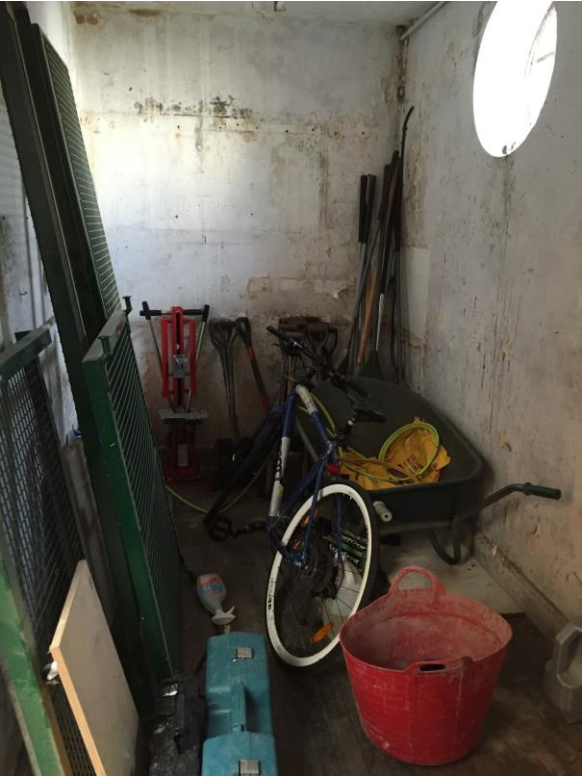
Fig 15. Lobby and former Kitchenette area.