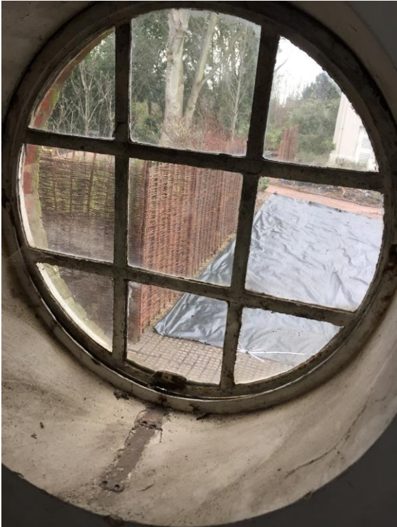
Fig. 3 Corroded metal 'Bullseye' window.