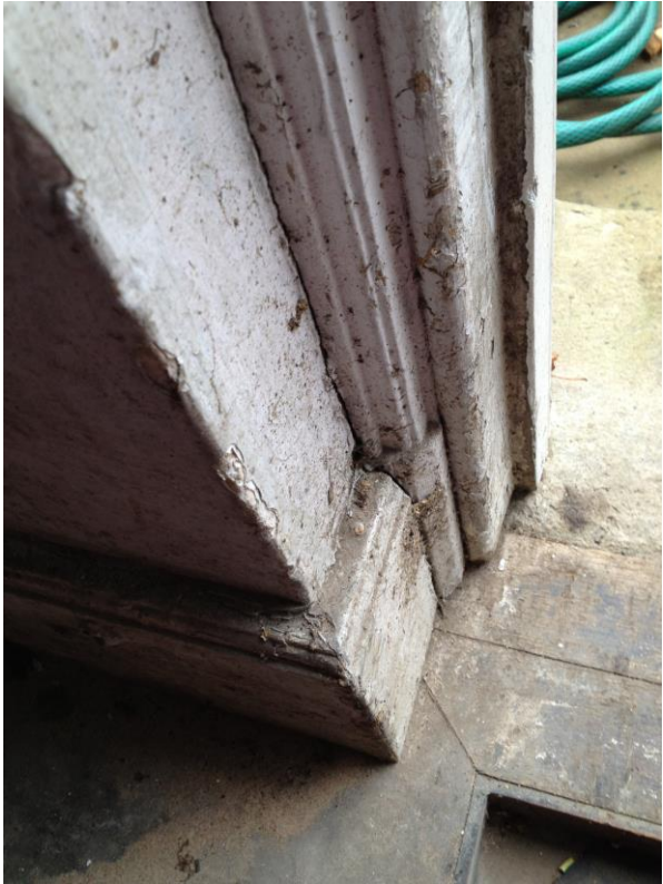
Fig. 47 existing skirting and architrave joinery details (Nov 15).