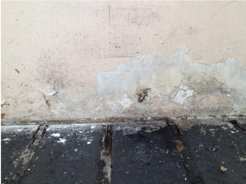
Fig. 21 Decayed timber battens revealed following asbestos removal (Dec 15).