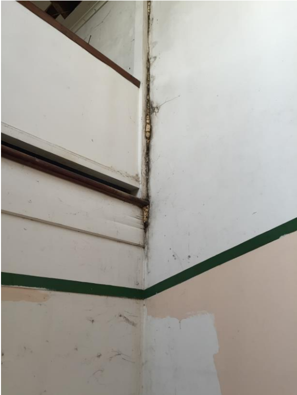
Fig. 12 Fungal decay along gallery boarding.