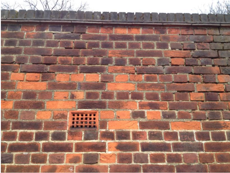
Fig. 30 South Elevation weathered brickwork.