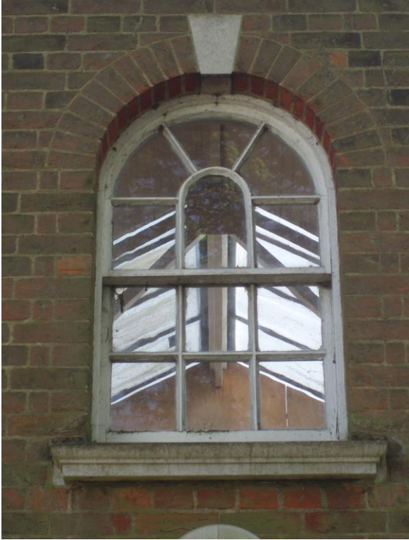
Fig. 36 Arched headed timber sash window at first floor.