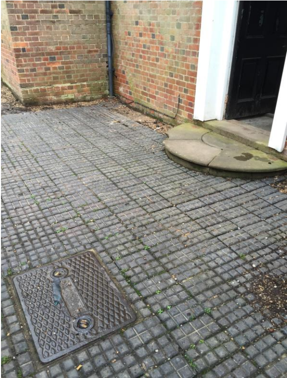
Fig. 37 Former yard paving and existing manhole connection.