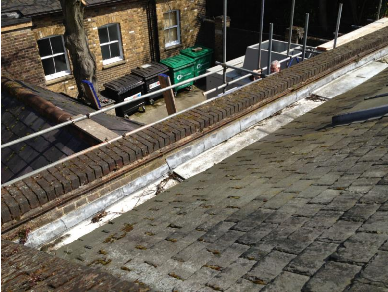
Fig. 22 North roof slope with patched lead parapet gutter.