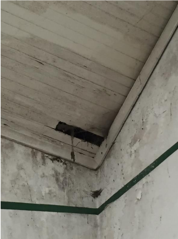
Fig. 42 Water ingress and damage (Dec 15).