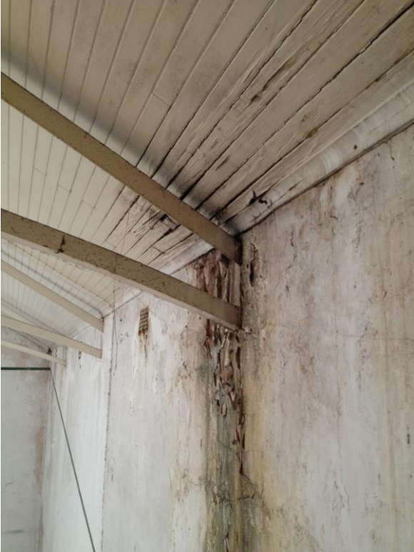
Fig. 40 Decayed soffit boarding and water ingress from parapet gutter.