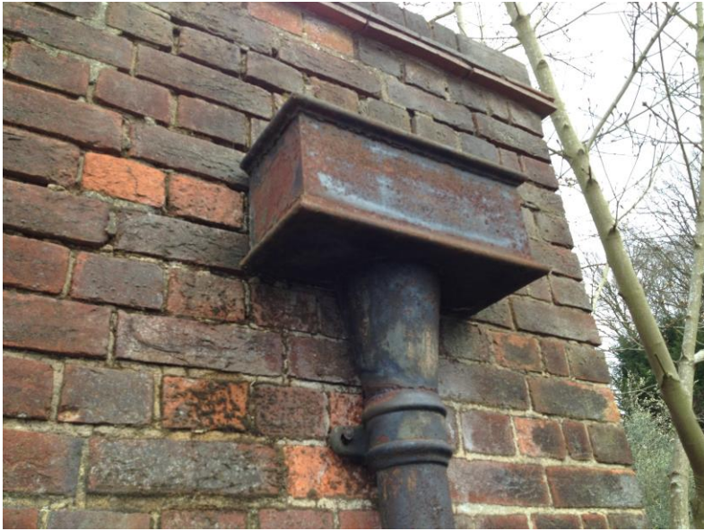
Fig. 33 Existing cast iron hopper head on SE corner.