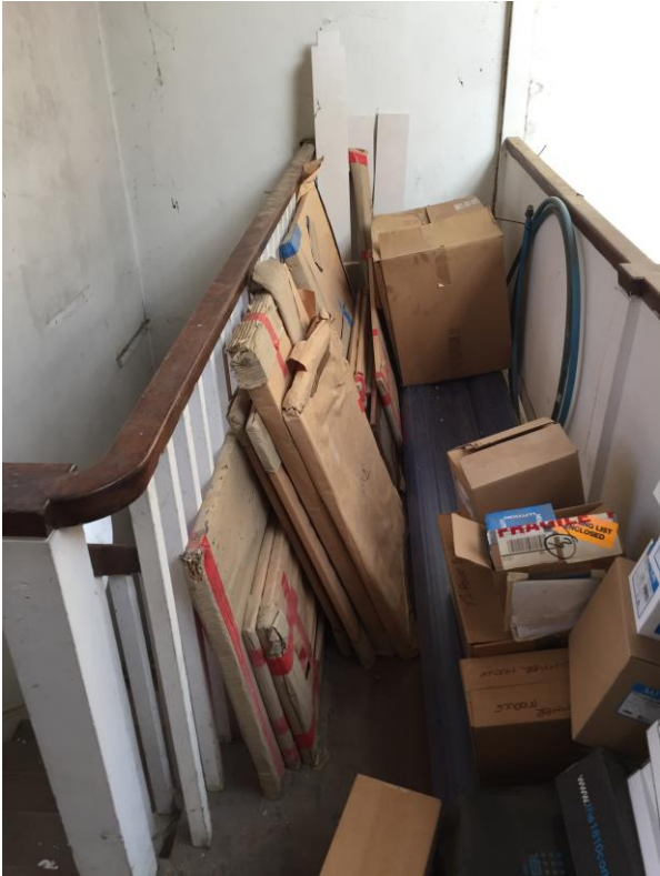
Fig. 11 Viewing Gallery and access stair.