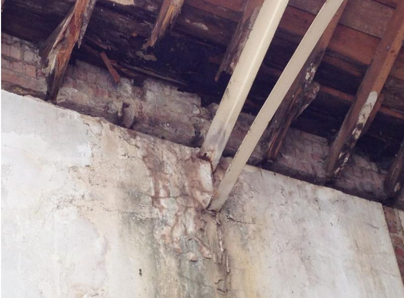
Fig. 41 Decayed wall plate, rafter feet and gutter lining (April 16).