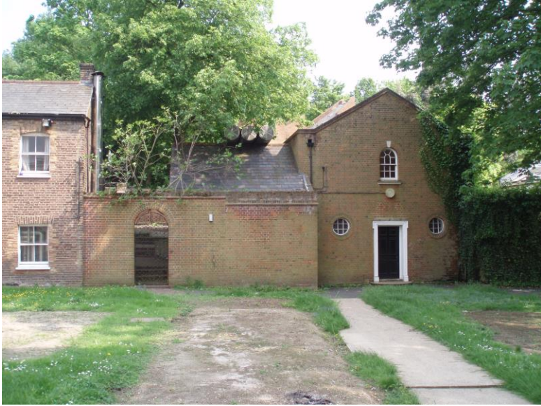
Fig.1 Squash Court in May 2008