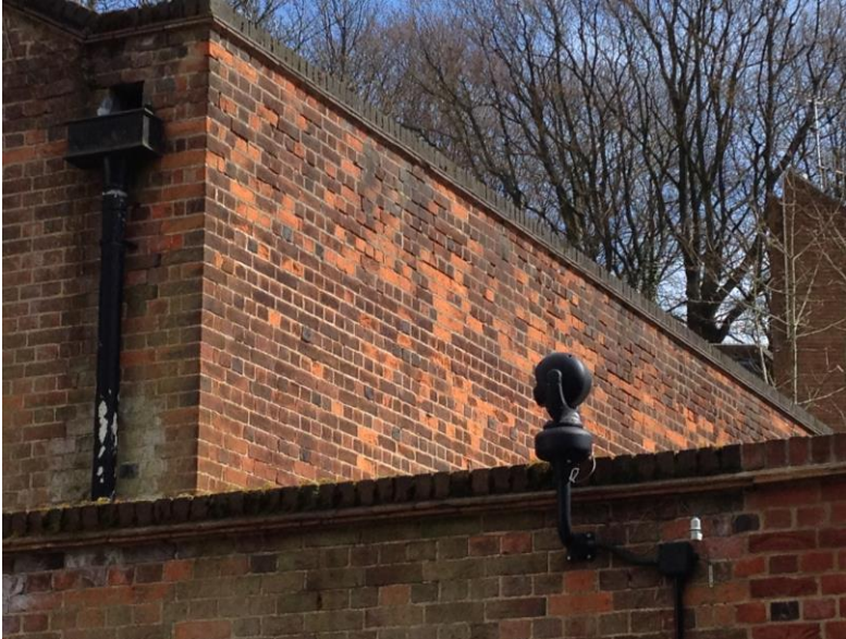
Fig. 25 South elevation from Kitchen Garden.