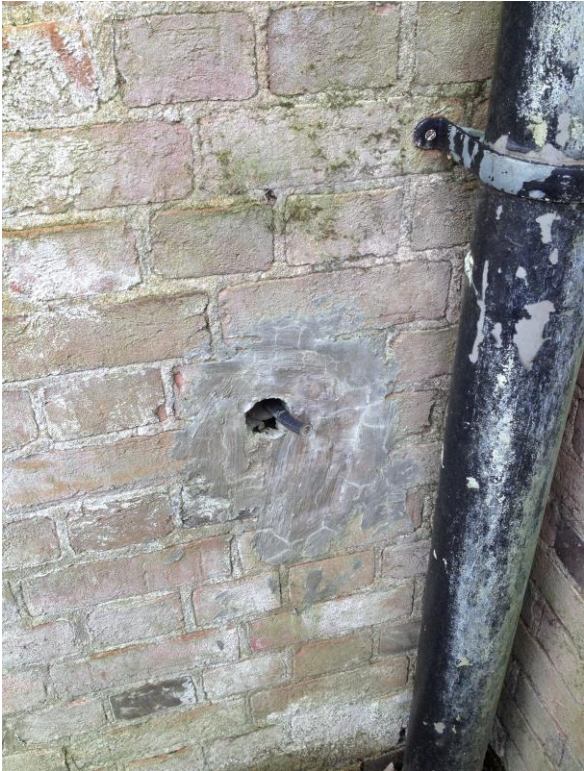
Fig. 34 Former waste pipe hole requiring making good.