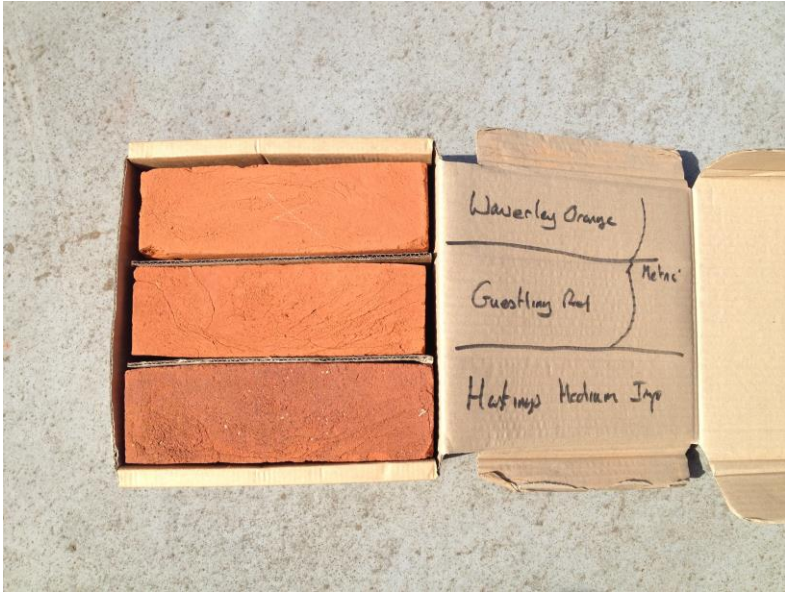
Fig. 32 Samples of replacement facing bricks (April 16).