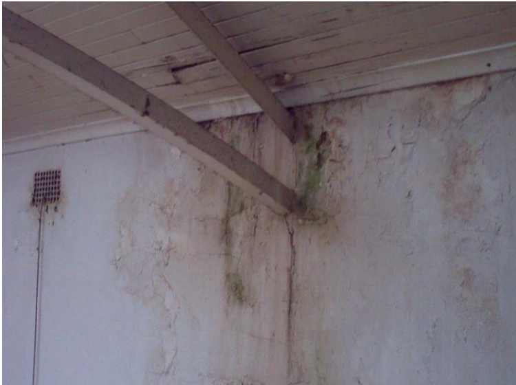
Fig. 8 Water ingress from leaking parapet gutters over truss.