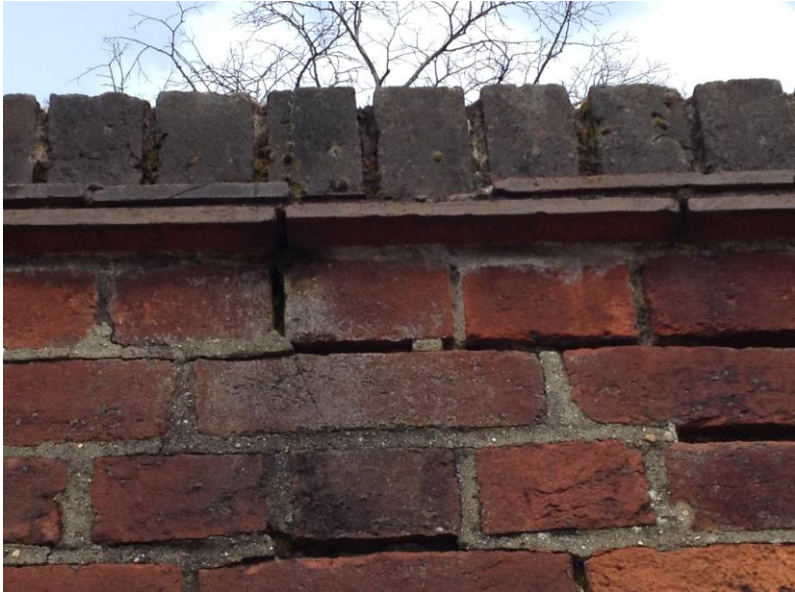
Fig. 28 Brick-on-edge and creasing tile parapet wall.