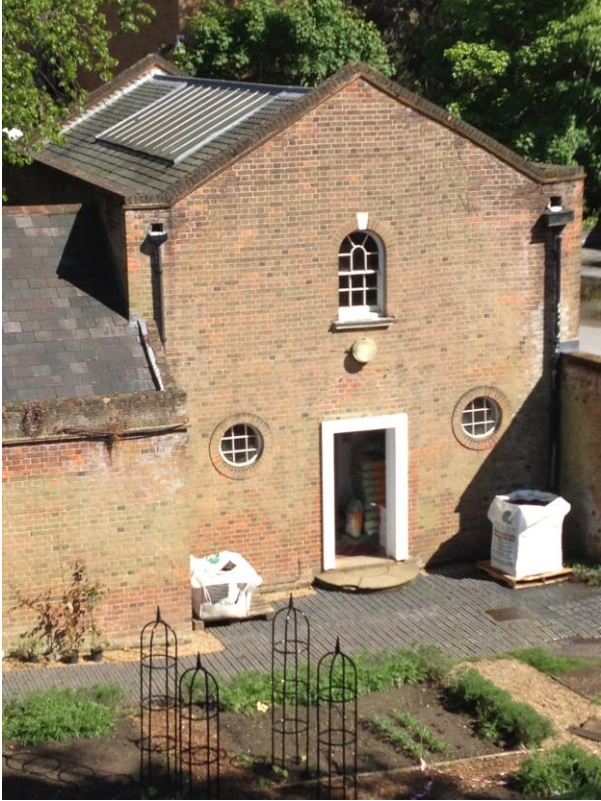
Fig. 24 West elevation from Beechwood House