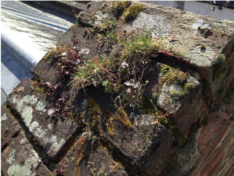
Fig. 29 Vegetation on parapet open brickwork joints.