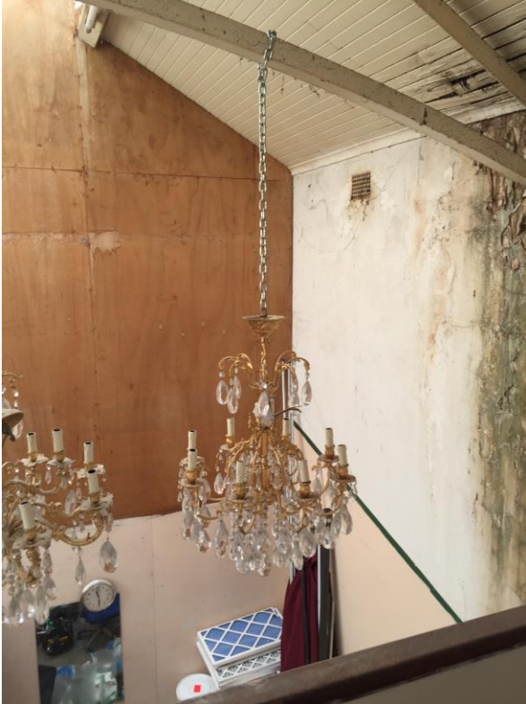
Fig. 9 Previous sub-division of court space by previous owners (present 2008).