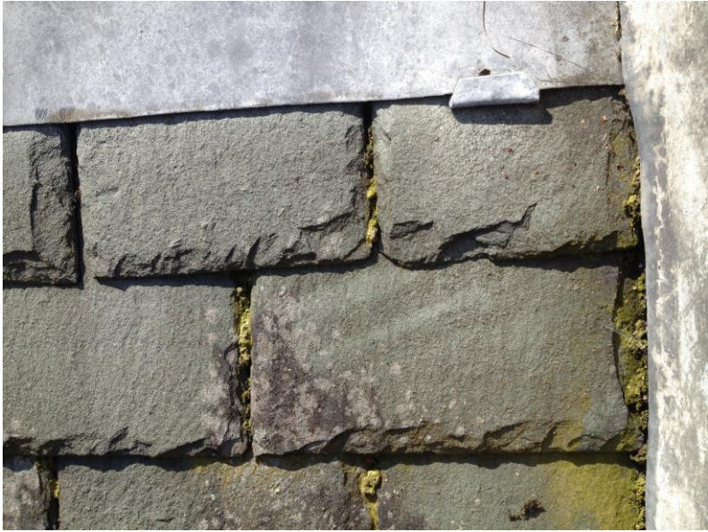
Fig. 23 Existing Westmoreland slates (re-used).