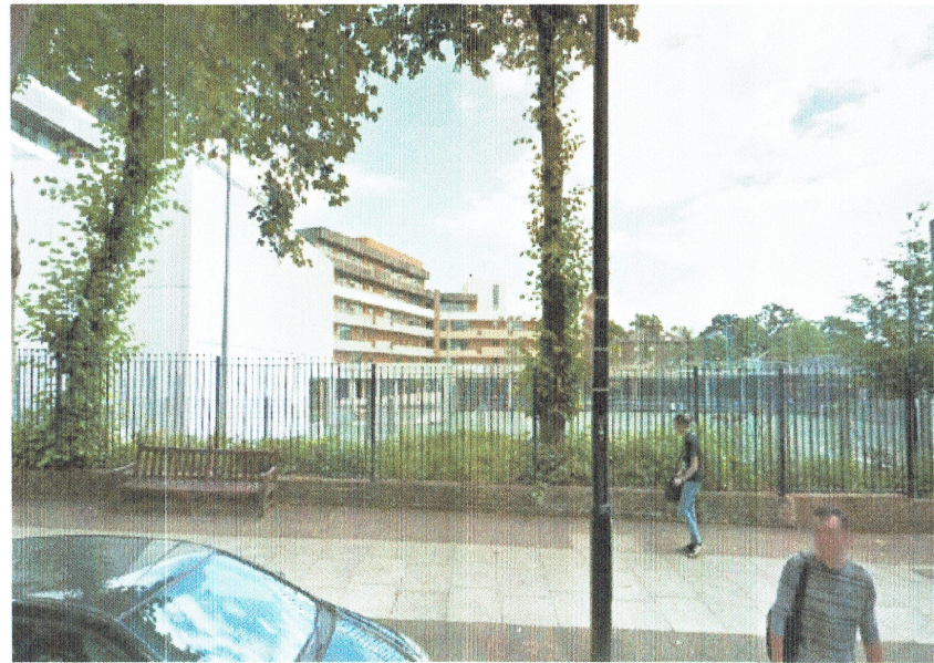
LOCATION B WITHOUT POLE