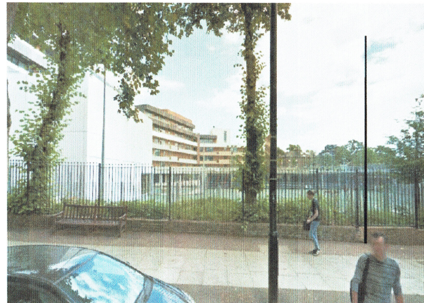
LOCATION B WITH POLE

A 5.5-metre high pole in the footpath adjacent to the right hand side of the brick pier to the right (north) of the pair of gates to the bins enclosure at 95 Avenue Road with a clear nylon filament crossing Avenue Road to a matching pole in the footpath in front of a post in the railings located above the dwarf wall on the west side of UCL Academy, beyond, to the south of the mature sycamore tree.