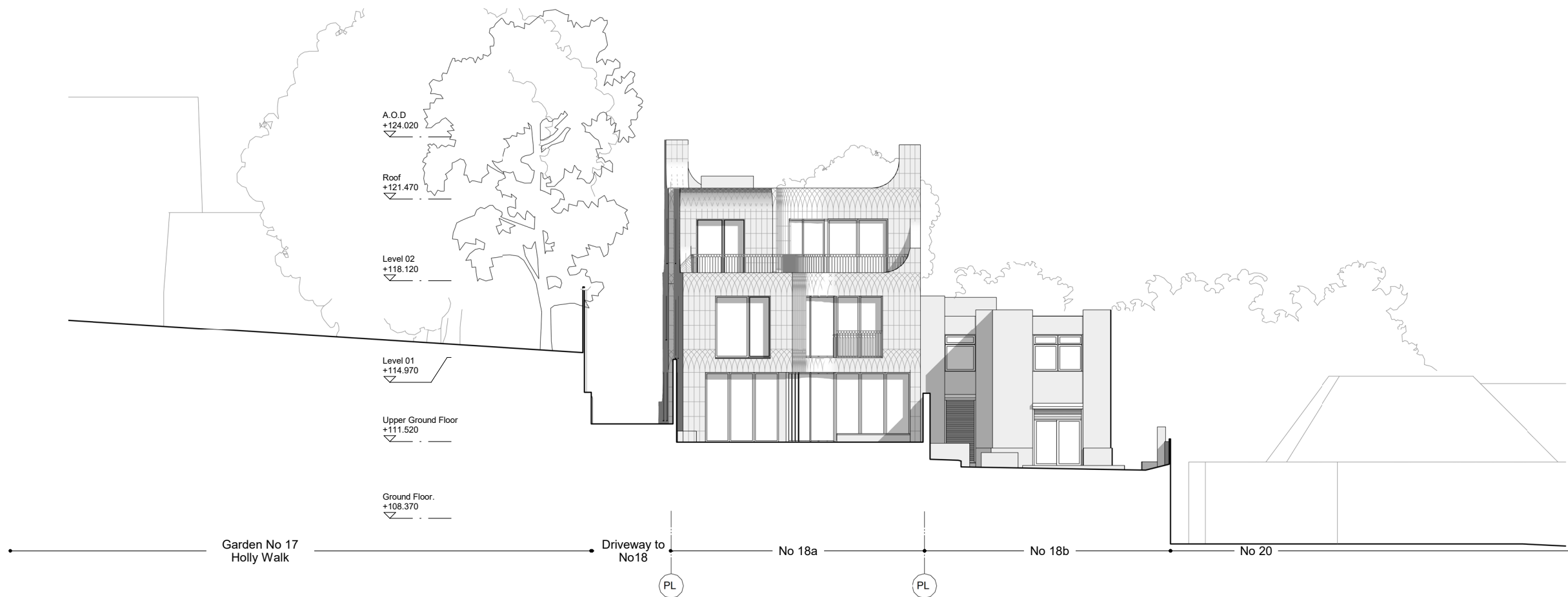
1 North Elevation