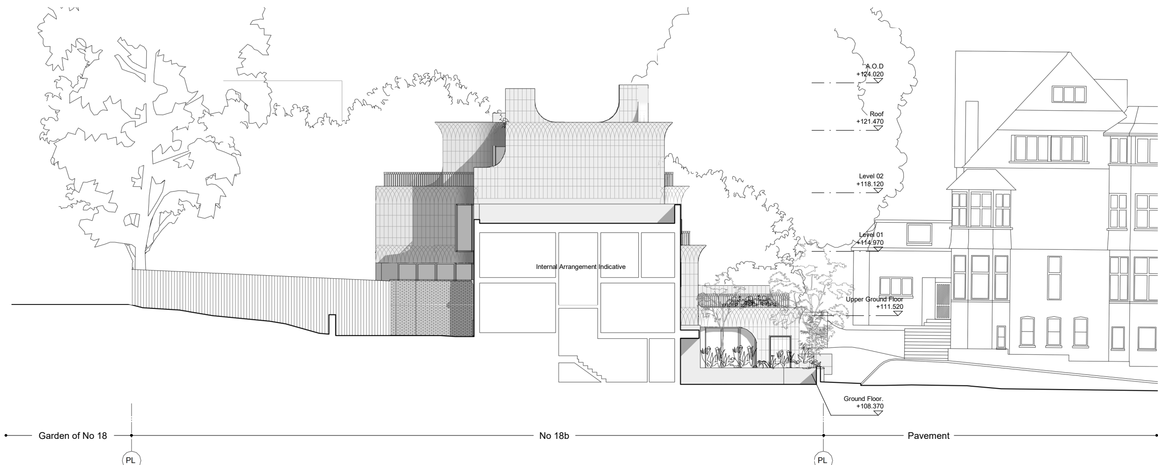
2 West Elevation