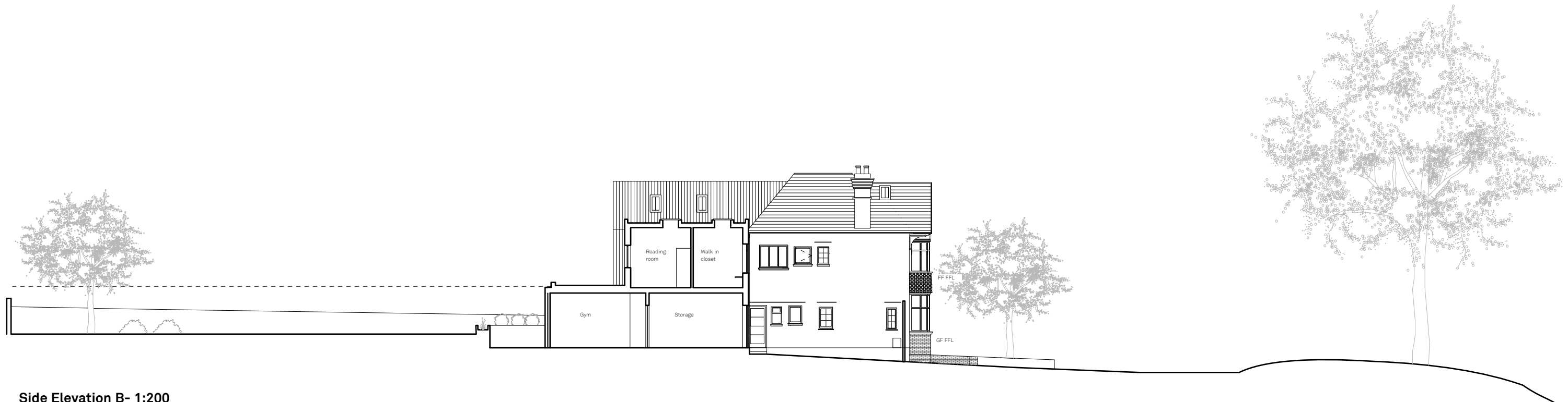
Side Elevation B- 1:200