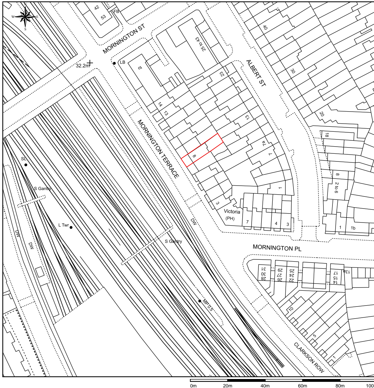
Scale: 1:1250, paper size: A4

S/A 10a Branch Place London N1 5PH p: 0207 686 3445 e: info@scenarioarchitecture.com w: www.scenarioarchitecture.com