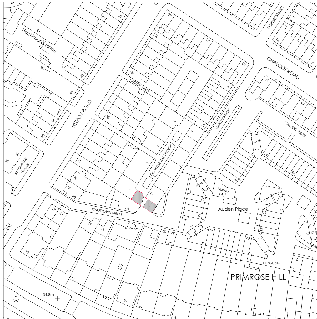
Location Plan 1:1250@A3