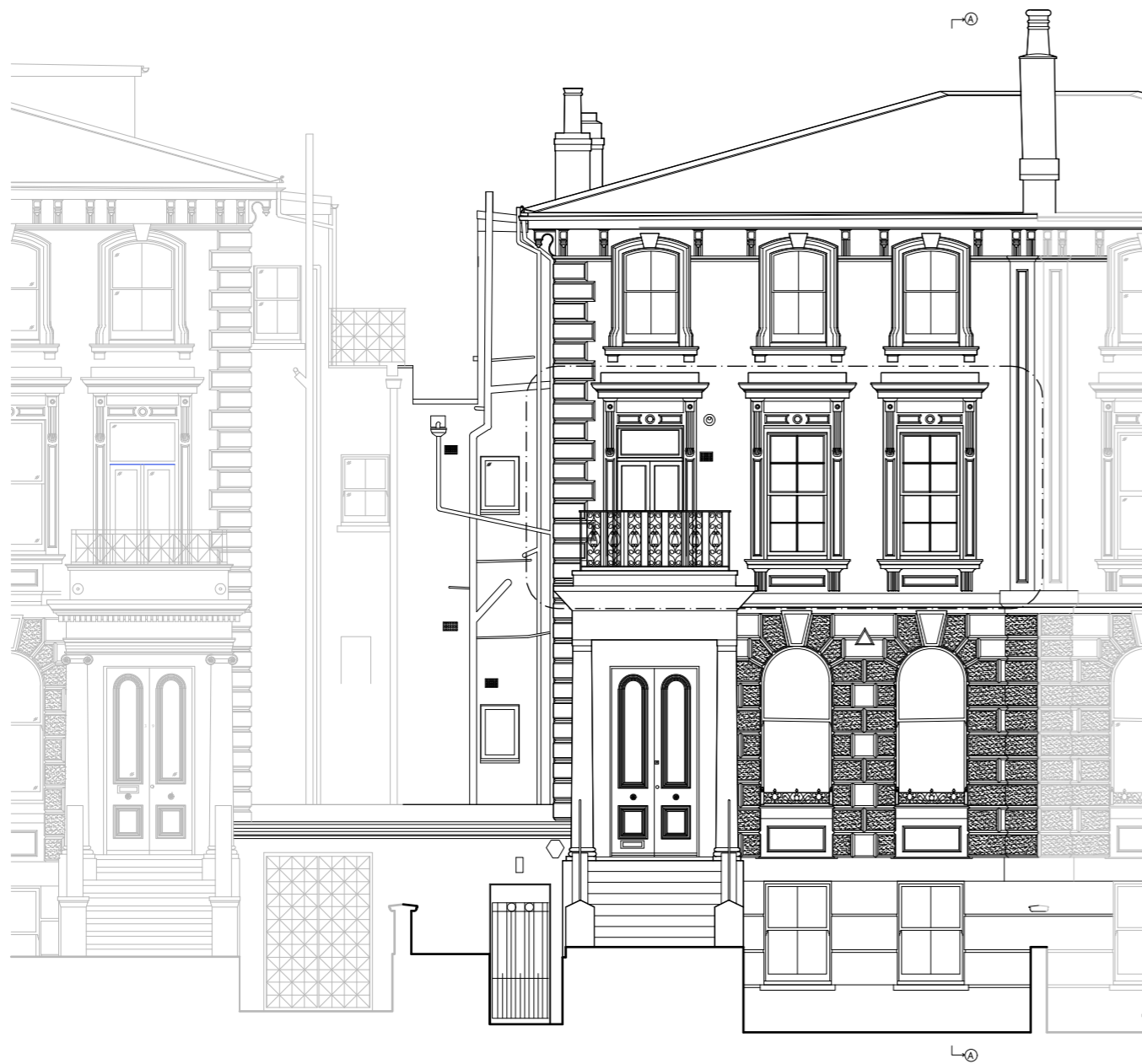
Existing Front Elevation 1:100@ A3