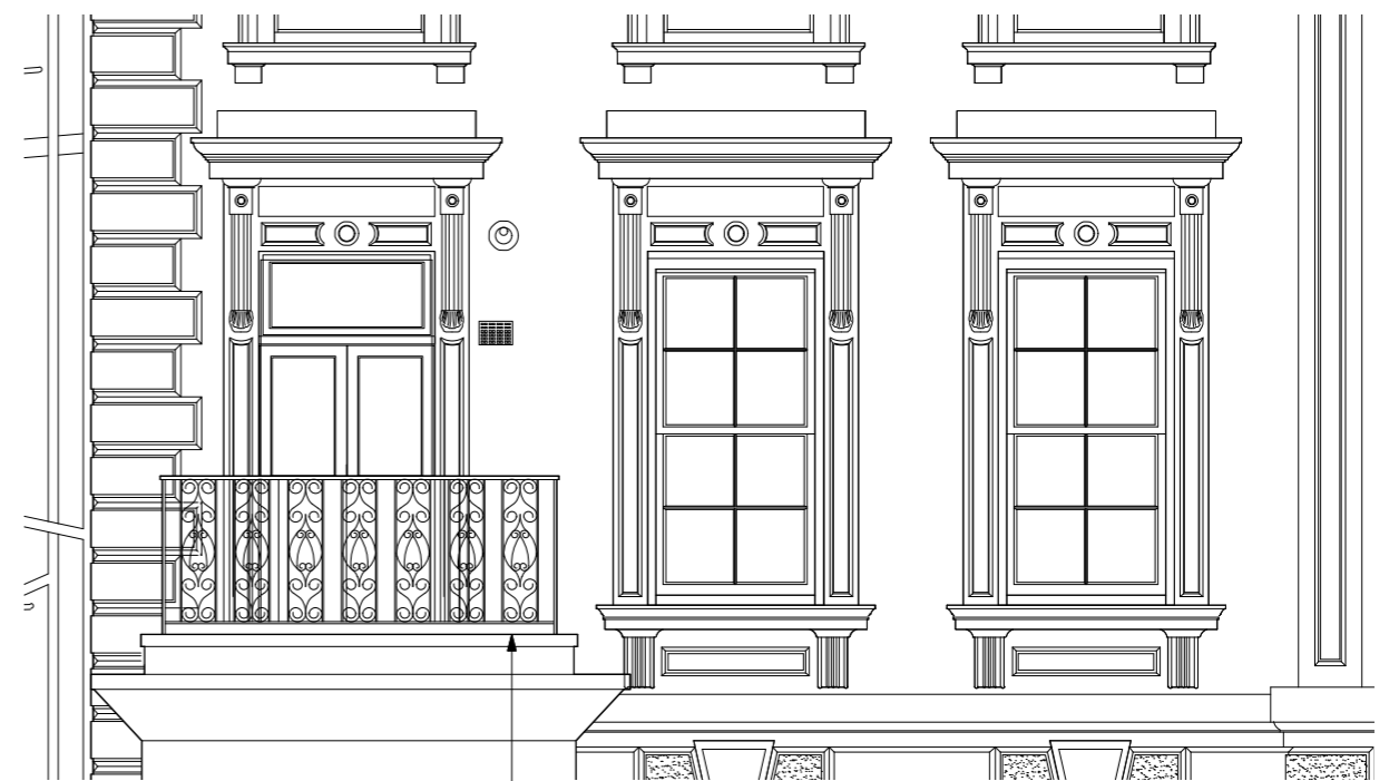
Existing First Floor Windows 1:50@ A3