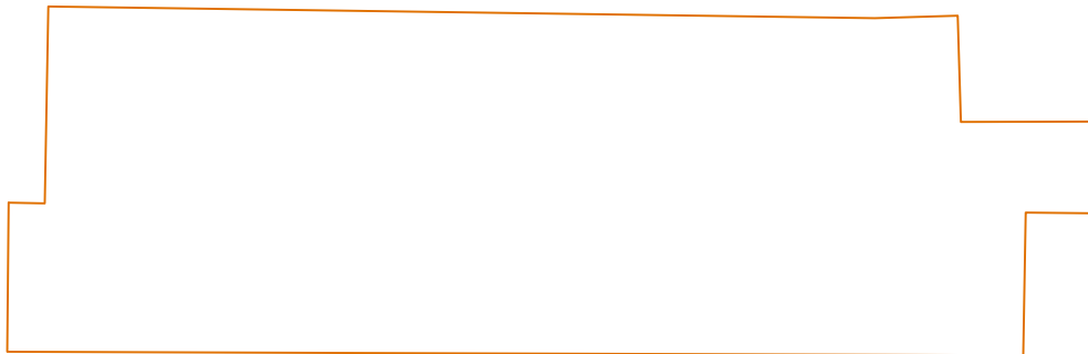
Floor Plan Layout 1:200