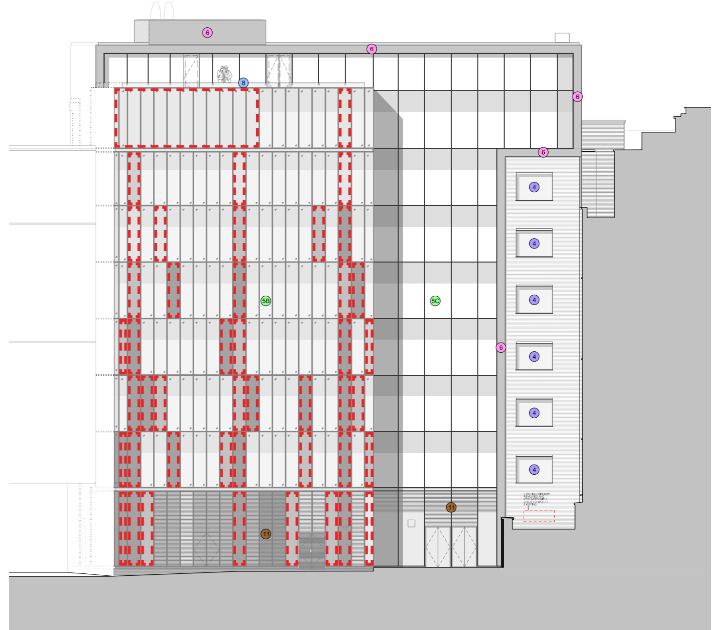
PROPOSED SOUTH ELEVATION - EXTRACT FROM DRAWING NO. 5578_02_222 REV C

The revised proposal is to replace the insulated aluminium cladding panels with insulated ceramic-frit glass panels. The range of grey coloured panels will be the same as the approved scheme.