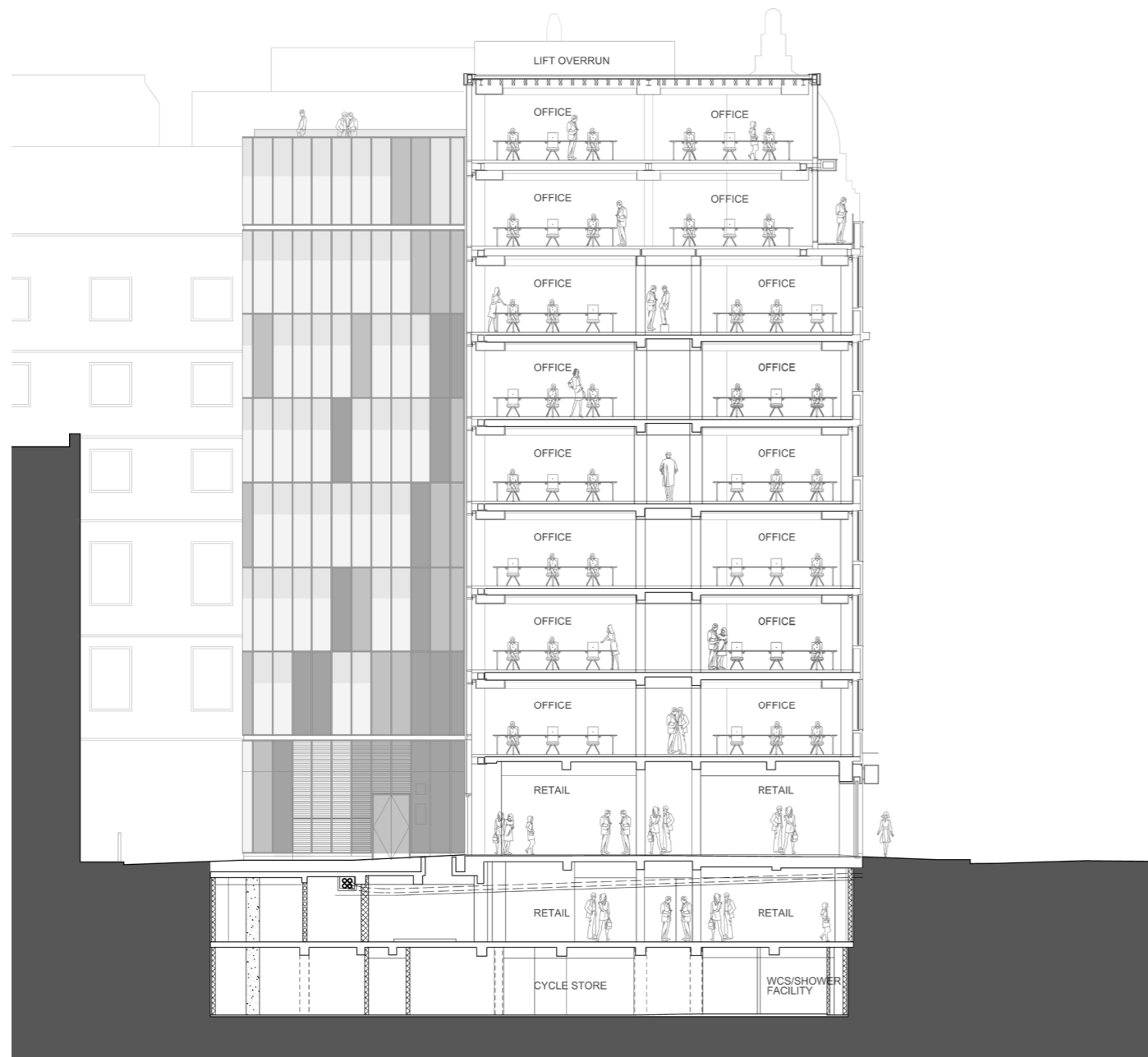
APPROVED EAST INTERNAL ELEVATION SECTION BB EXTRACT FROM DRAWING NO. 5578_02_223 REV A

The revised proposal is to replace the insulated aluminium cladding panels with insulated ceramic-frit glass panels as per the south elevation. The range of grey coloured panels will be the same as the approved scheme.