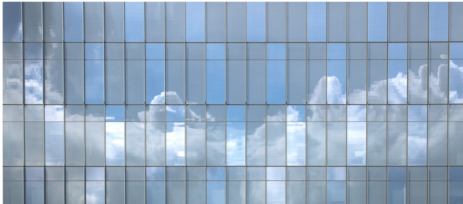
PROPOSED CERAMIC-FRIT GLASS PANEL CLADDING