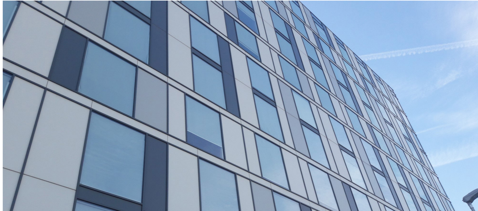
APPROVED METAL PANEL CLADDING