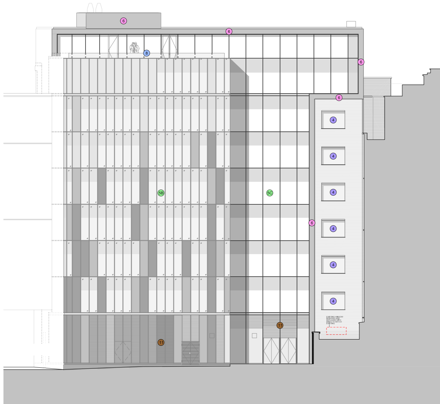
APPROVED SOUTH ELEVATION - EXTRACT FROM DRAWING NO. 5578_02_222 REV B

The south elevation, as consented, features a curtain walling system consisting of clear/fritted glazing and insulated aluminium cladding panels with a range of grey coloured panels.