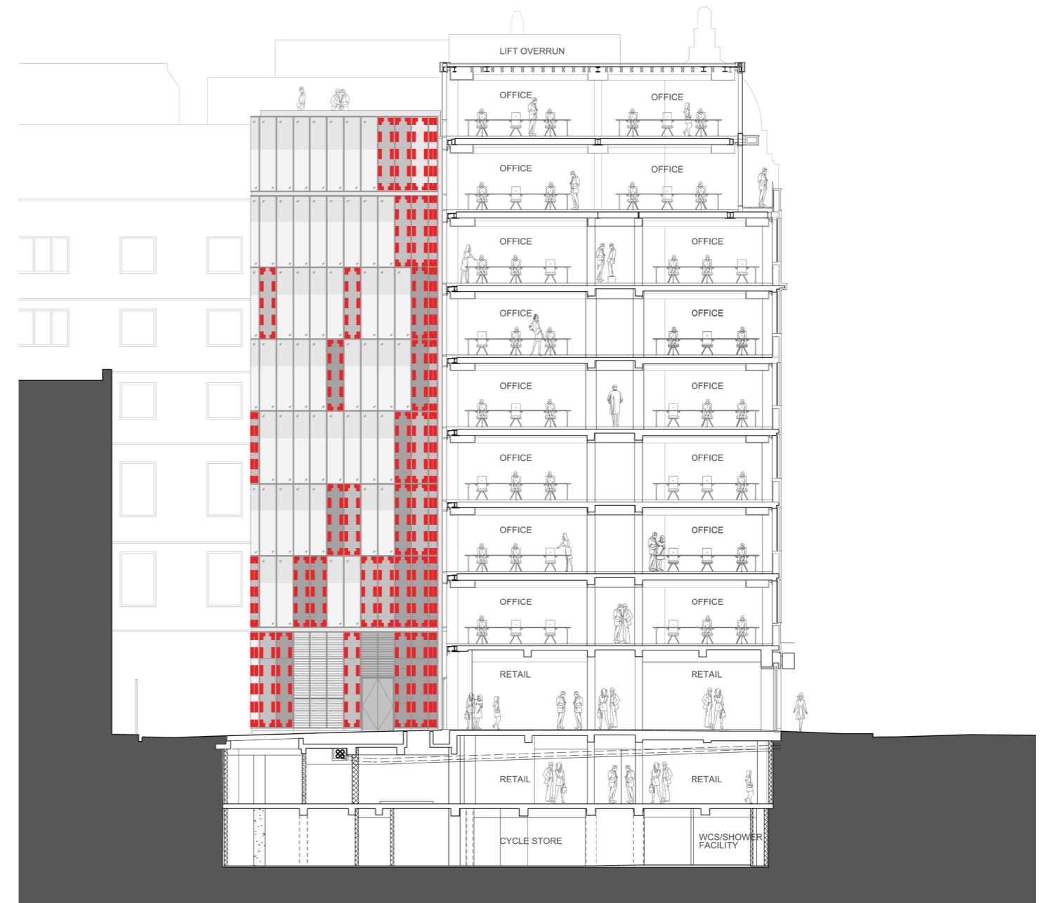
PROPOSED EAST INTERNAL ELEVATION SECTION BB EXTRACT FROM DRAWING NO. 5578_02_223 REV B