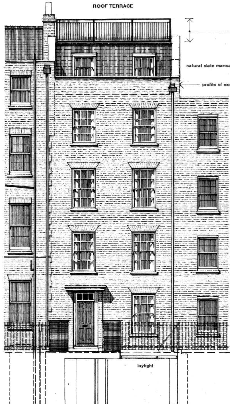
Proposed Street Elevation