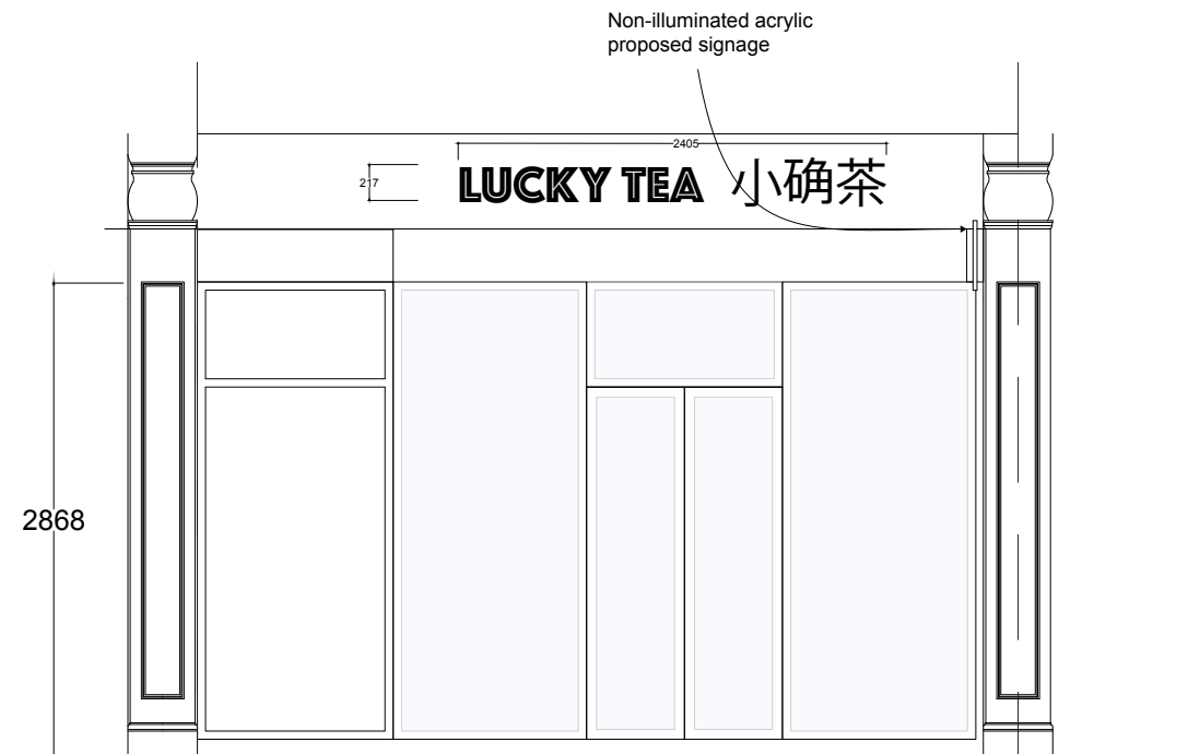
Proposed Elevation Scale 1:50