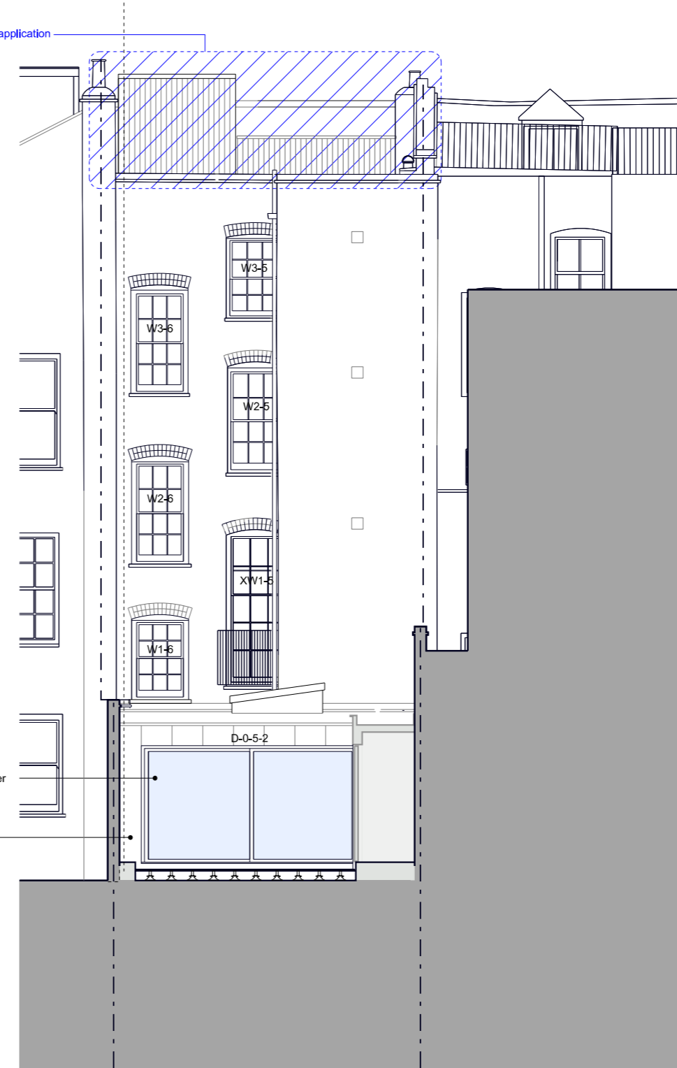
PROPOSED REAR ELEVATION 2

Drawings may be scaled for purposes of Planning. Any discrepancies should be reported immediately to the designer. If in doubt ask. This drawing is copyright of the designer. These drawings are based on plans provided by others. The designer accepts no liability for inaccuracies. Check all dimensions on site before proceeding with the works.