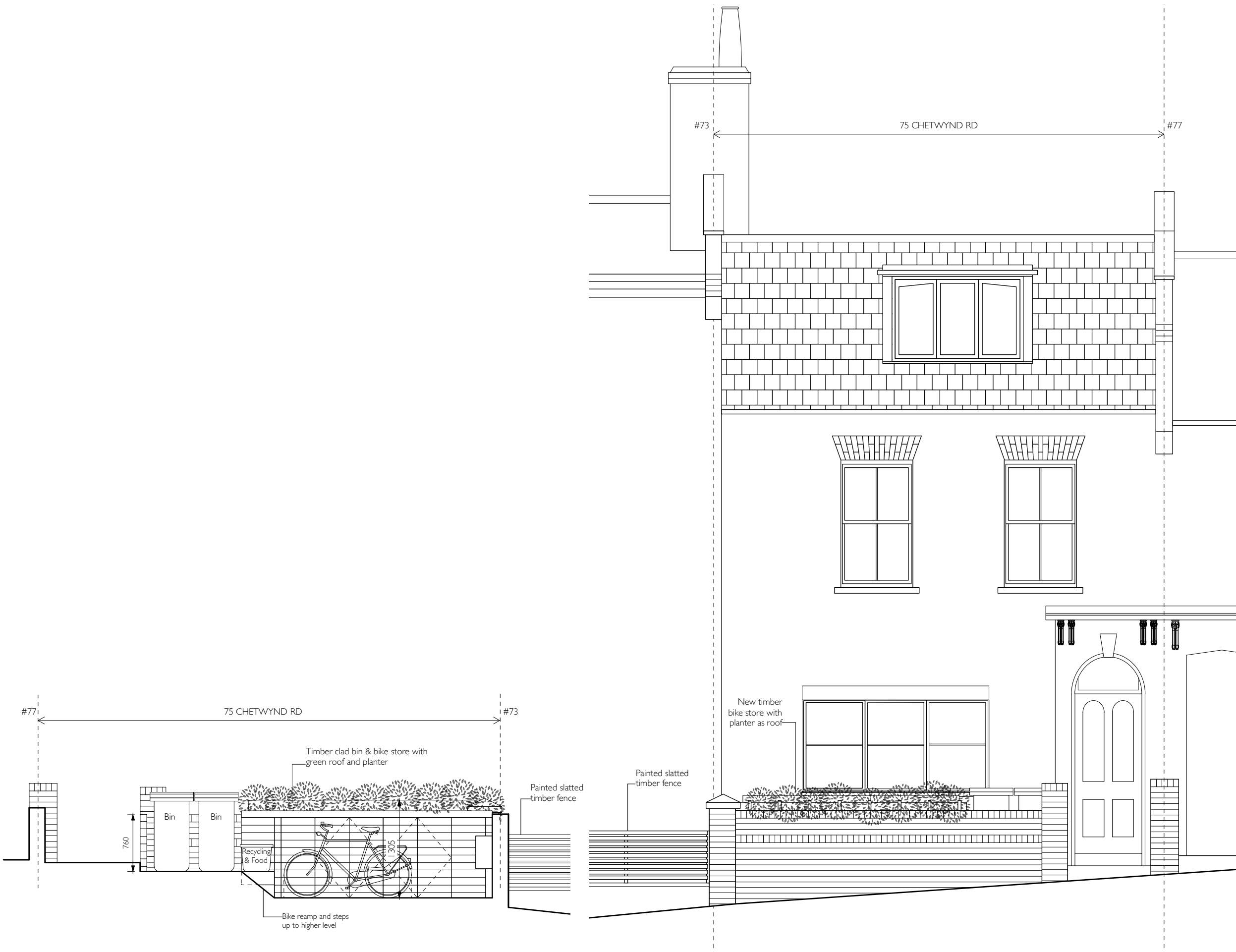
1 ELEVATION C 1:50 @ A3