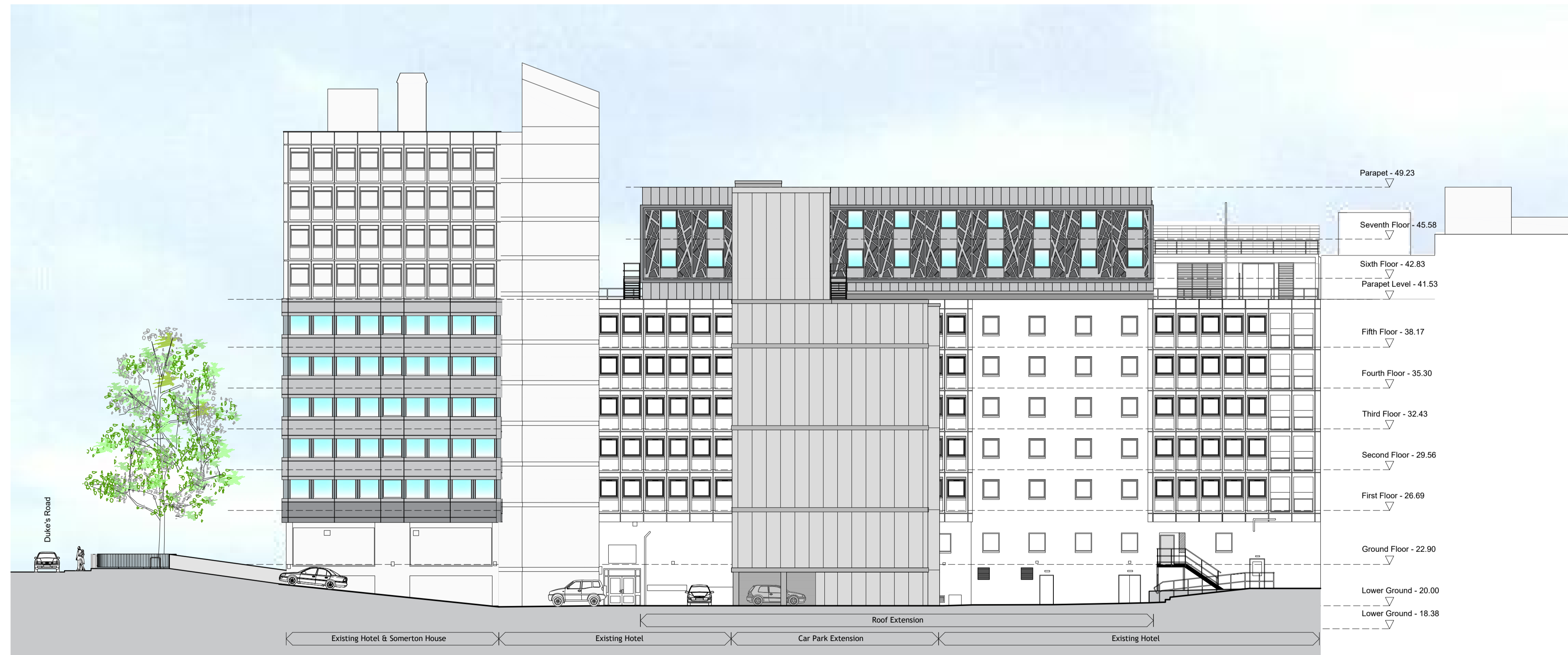
Proposed South East Elevation - To Service Area