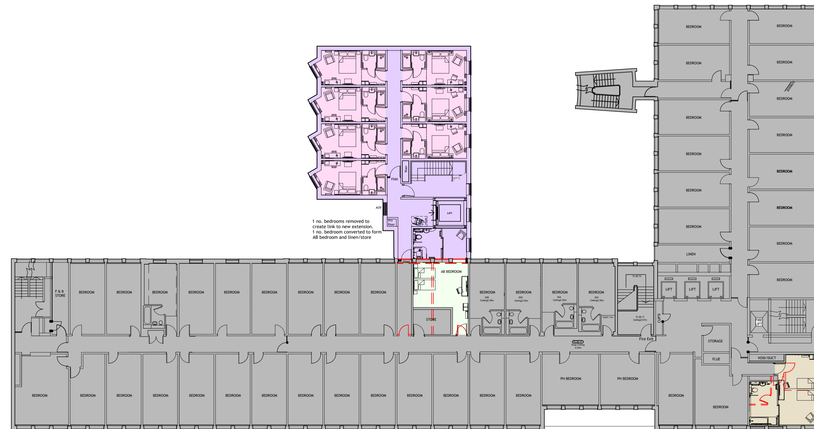
Proposed First to Fourth Floor Plans