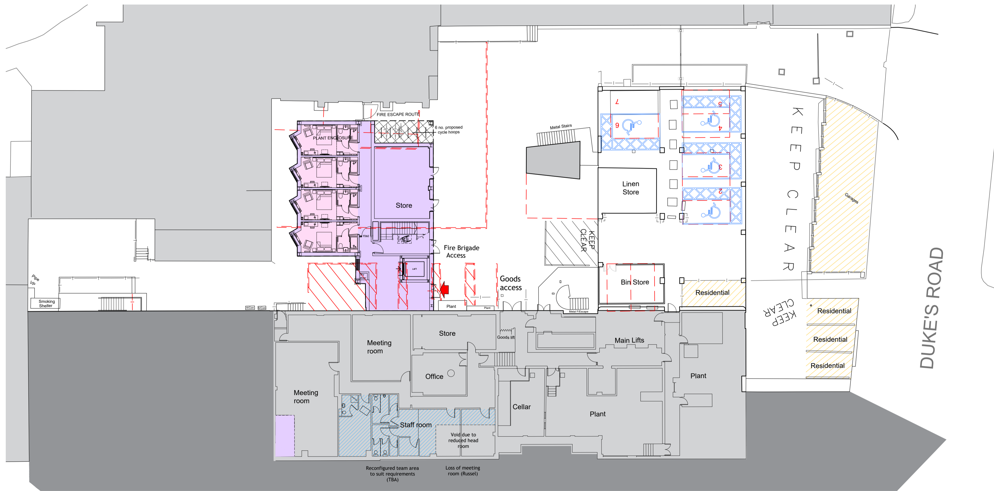
Proposed Lower Ground Floor Plan