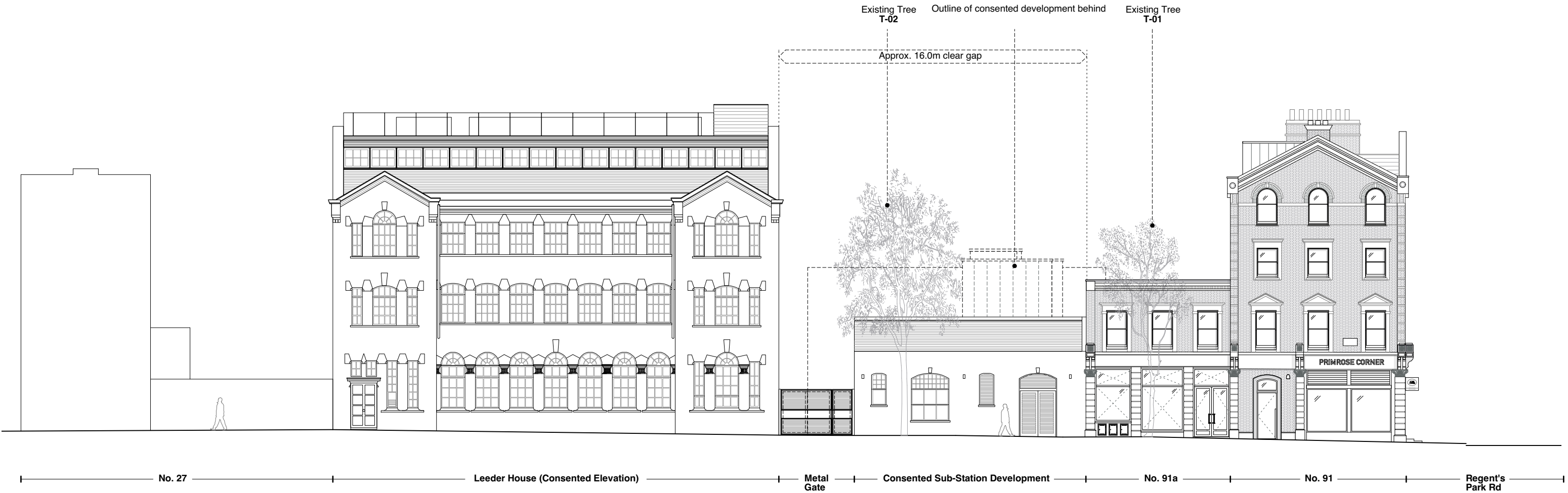
ERSKINE ROAD ELEVATION