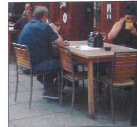
STYLE OF FURNITURE