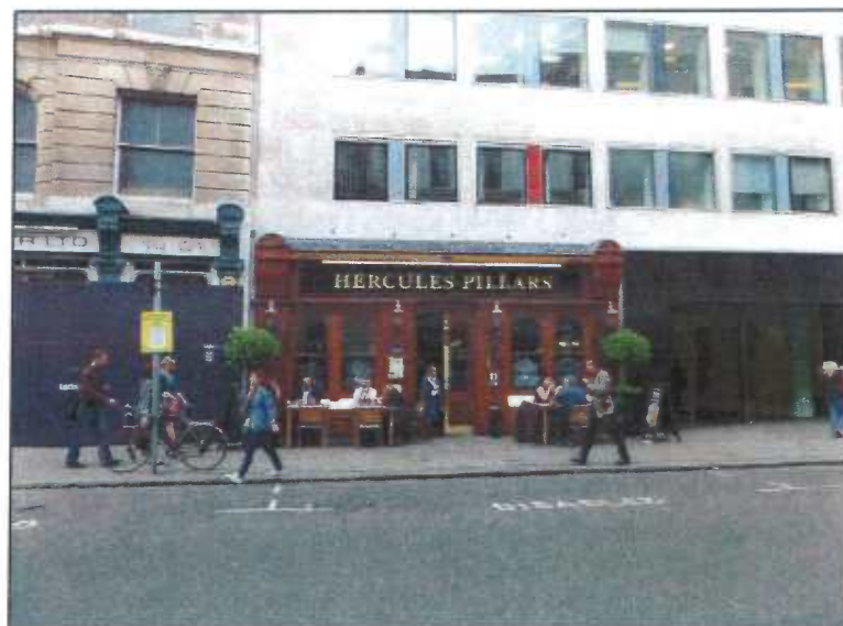
PHOTOGRAPH - B