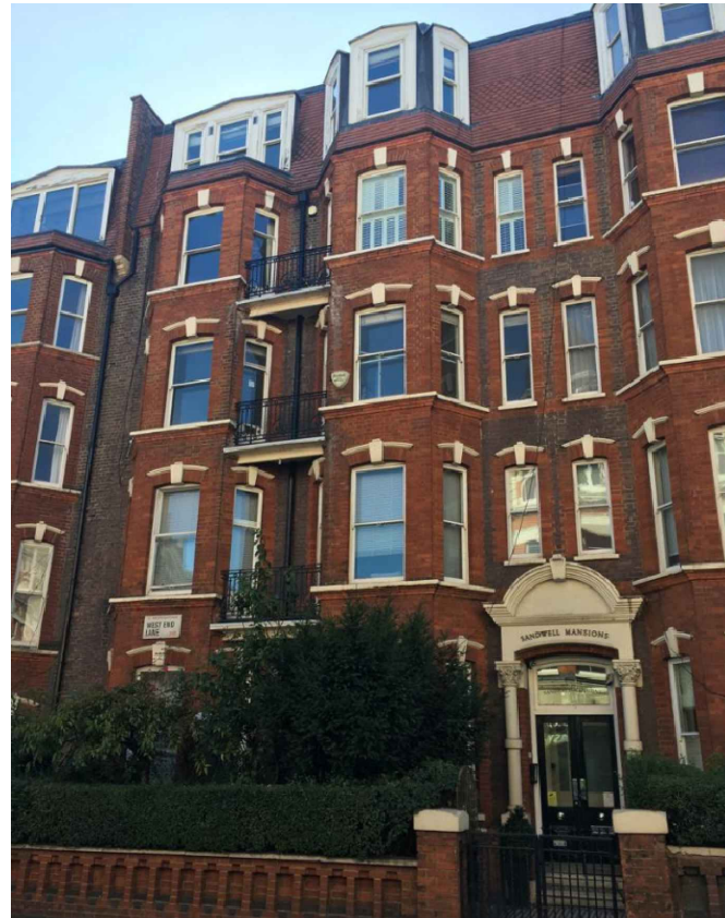
Image of the existing