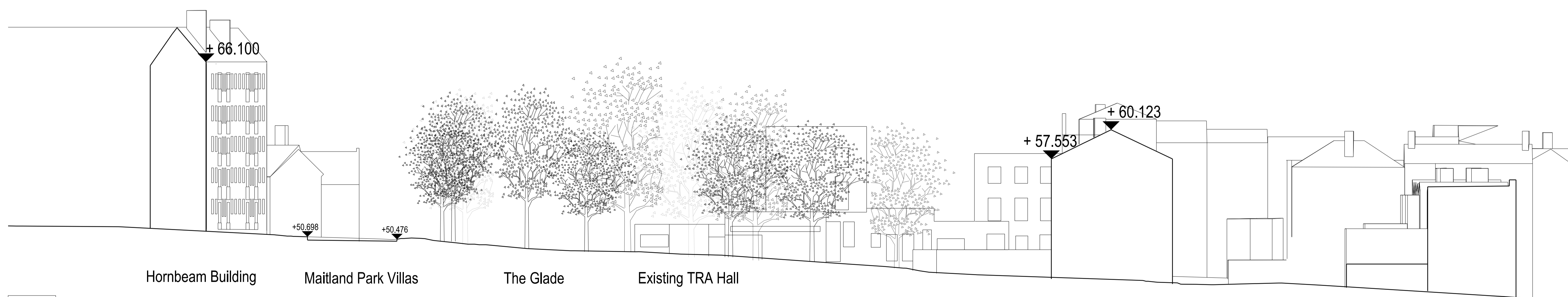
E03 Elevation 3 - Grafton Terrace from the Glade P40 1:200