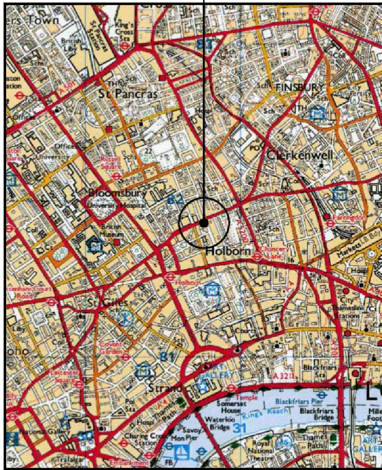
SITE LOCATION PLAN (Scale 1:25,000)

0 0.5km 1km 2km ORIGINAL SCALE AT A3 - 1:25000