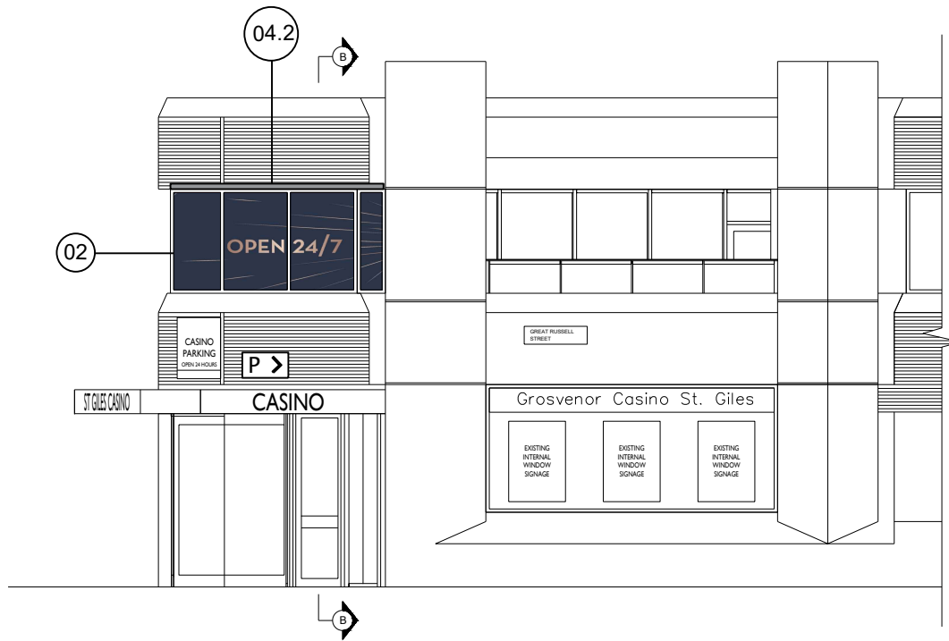
GREAT RUSSELL STREET/SOUTH ELEVATION