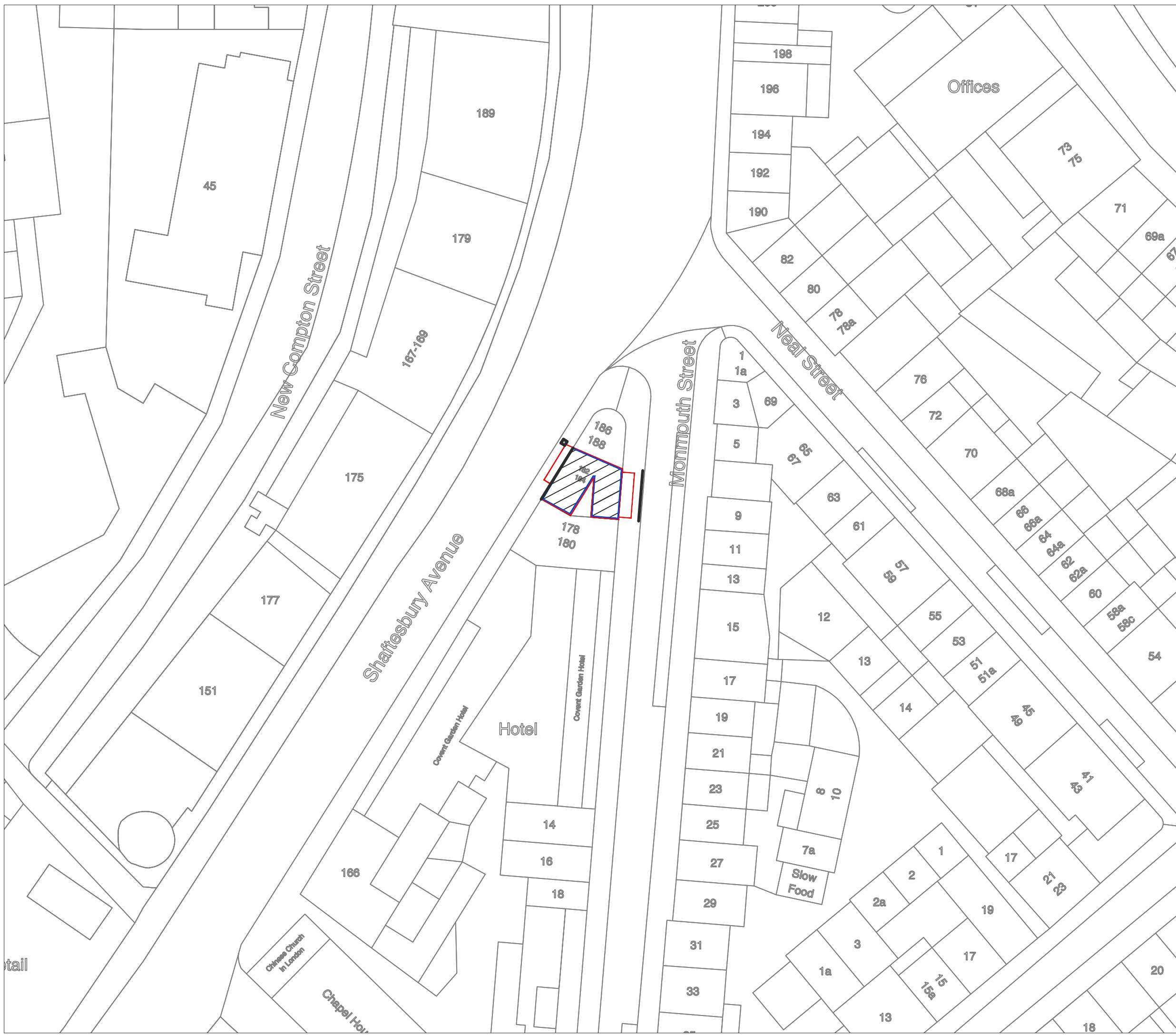
SITE LOCATION PLAN 1:500 @ A0 0 10 20 30 40