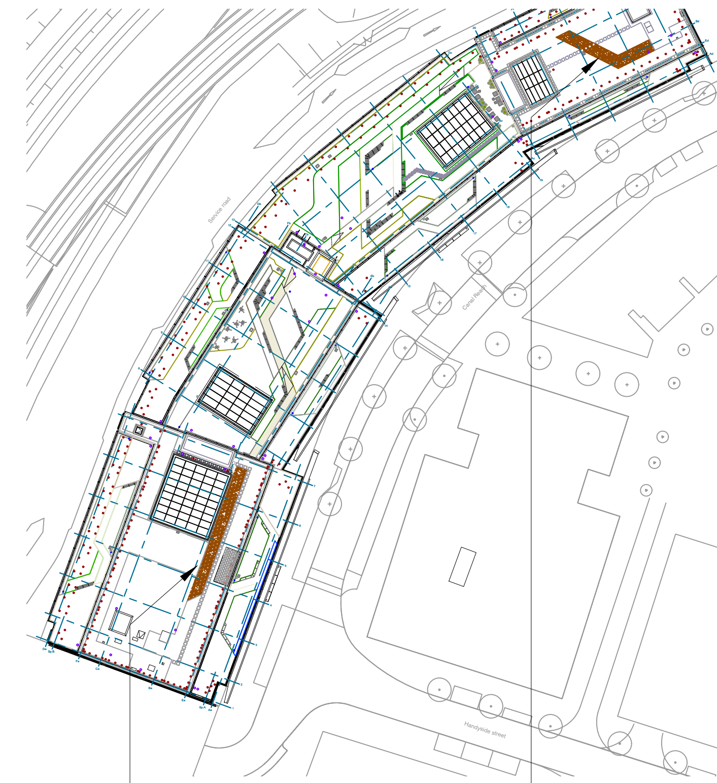
Ecological Strip on Block S1 Level 12 Ecological Strip on Block N2 Level 10