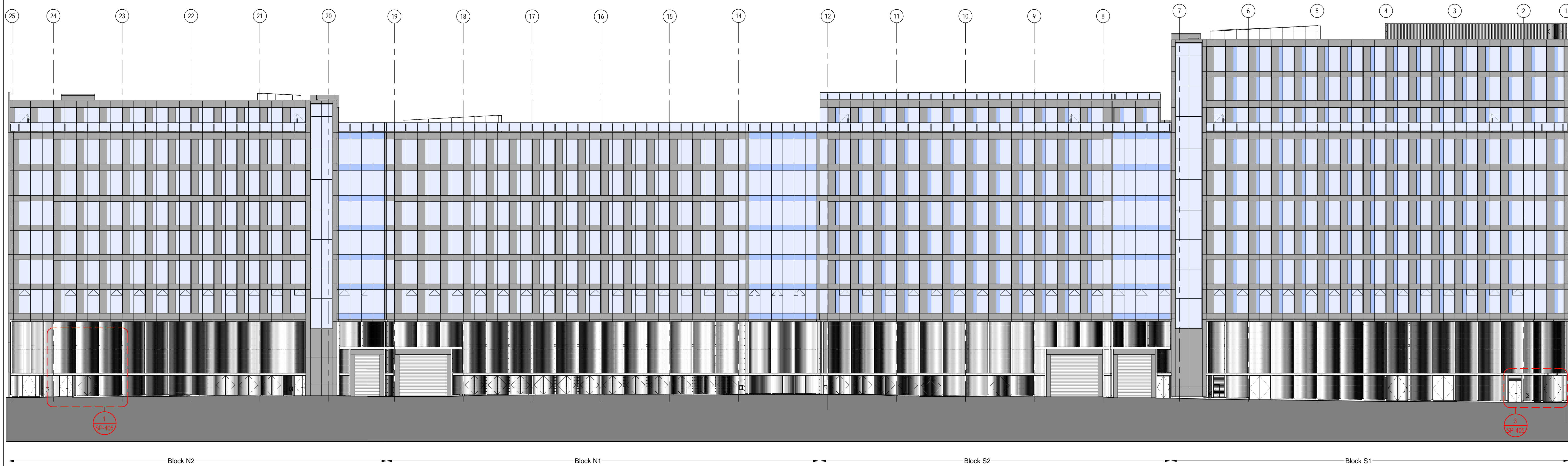
1 West Elevation