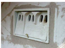
1SP built into a wall

Tree Sparrow ( Passer montanus ): Also widely distributed throughout towns and villages as well as the surrounding fields, farms, woodlands and hedges, and woodlands bordering rivers and streams.