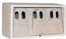
Sparrow Terrace 1SP

Different species of Sparrows can be found around our human homes: