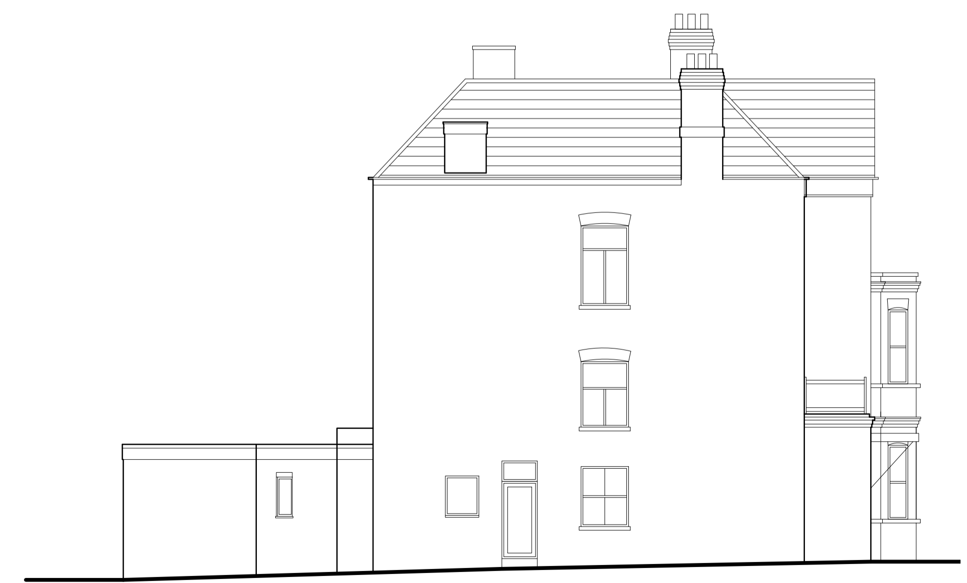
Existing Side (West) Elevation SCALE 1:100