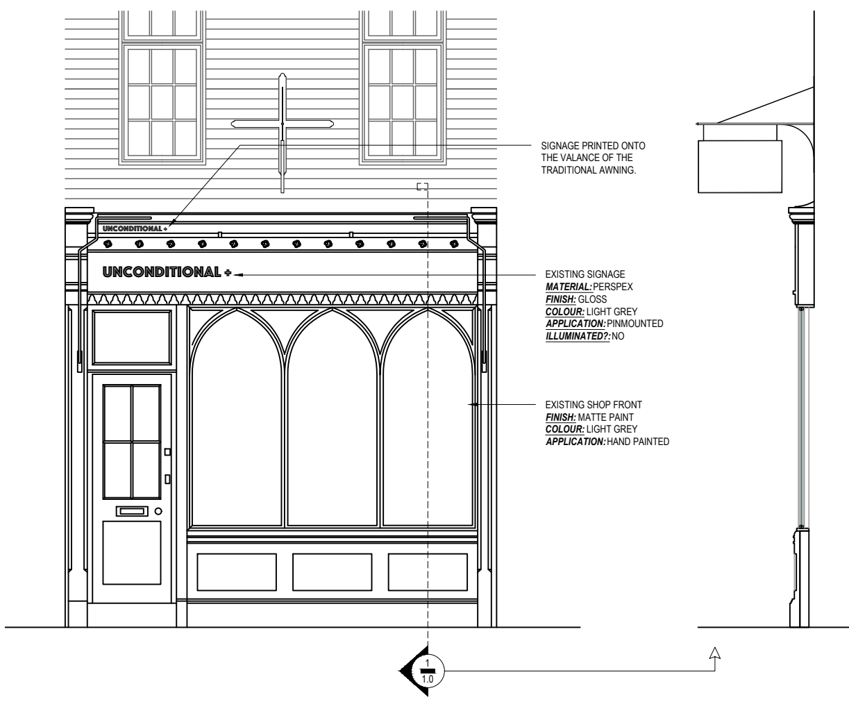
1 ELEVATION + SECTION EXISTING CONDITION OF THE SHOPFRONT SCALE: 1:50 @ ISO A3