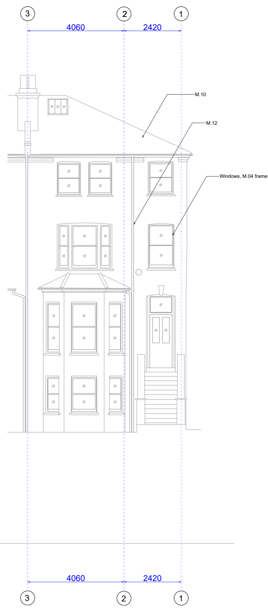
02 - West Elevation