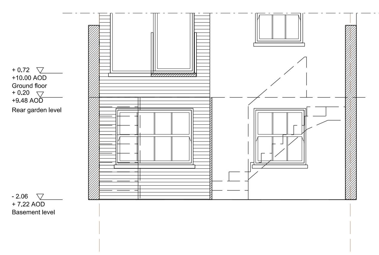
Proposed Rear Elevation - Section through lightwell