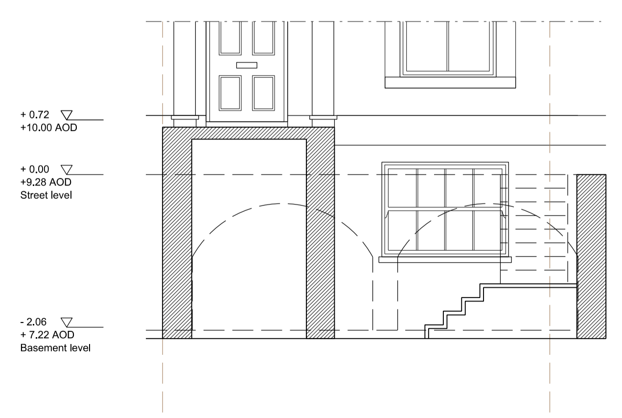
Proposed Front Elevation - Section through lightwell