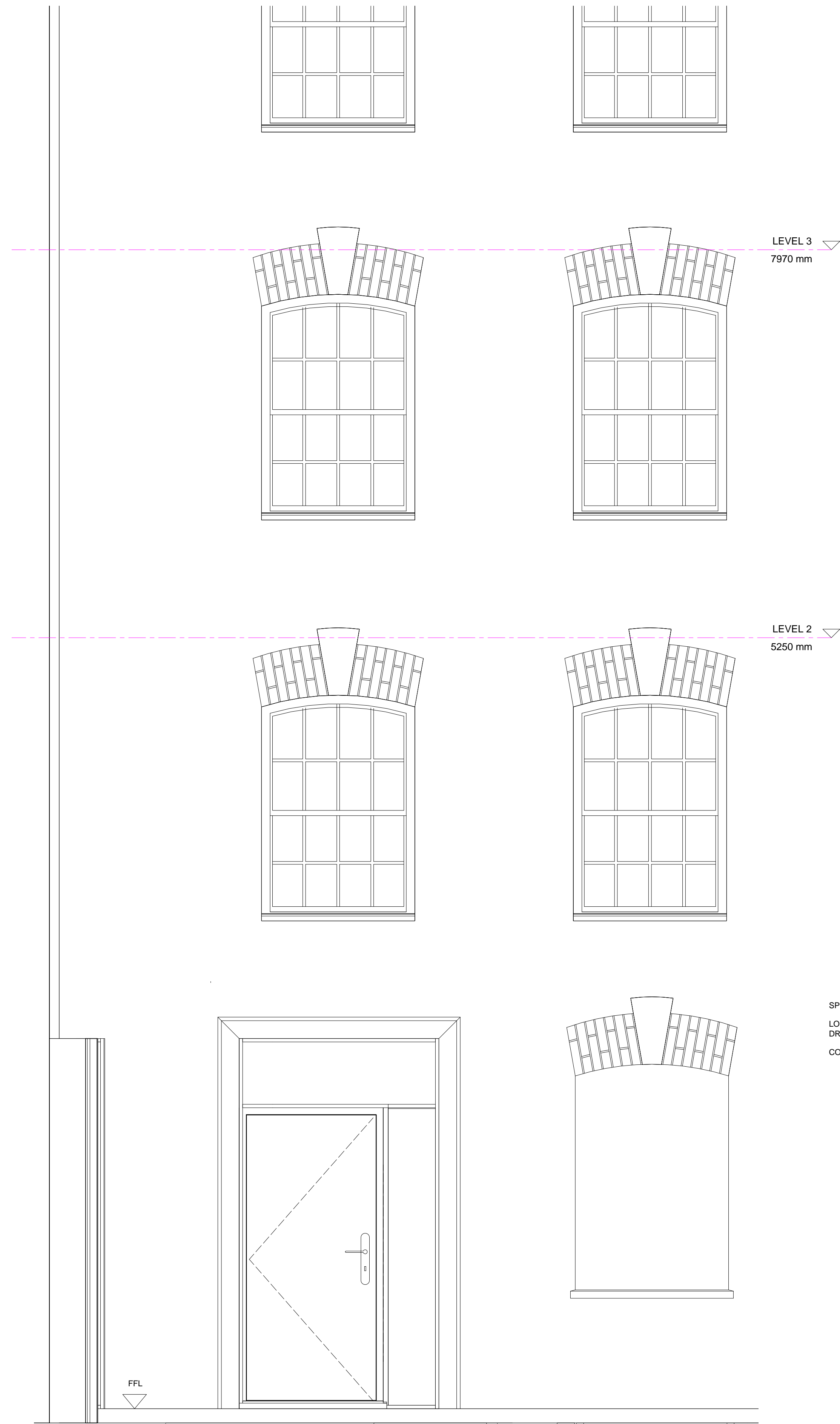
1 ELEVATION EXISTING MAIN ENTRANCE