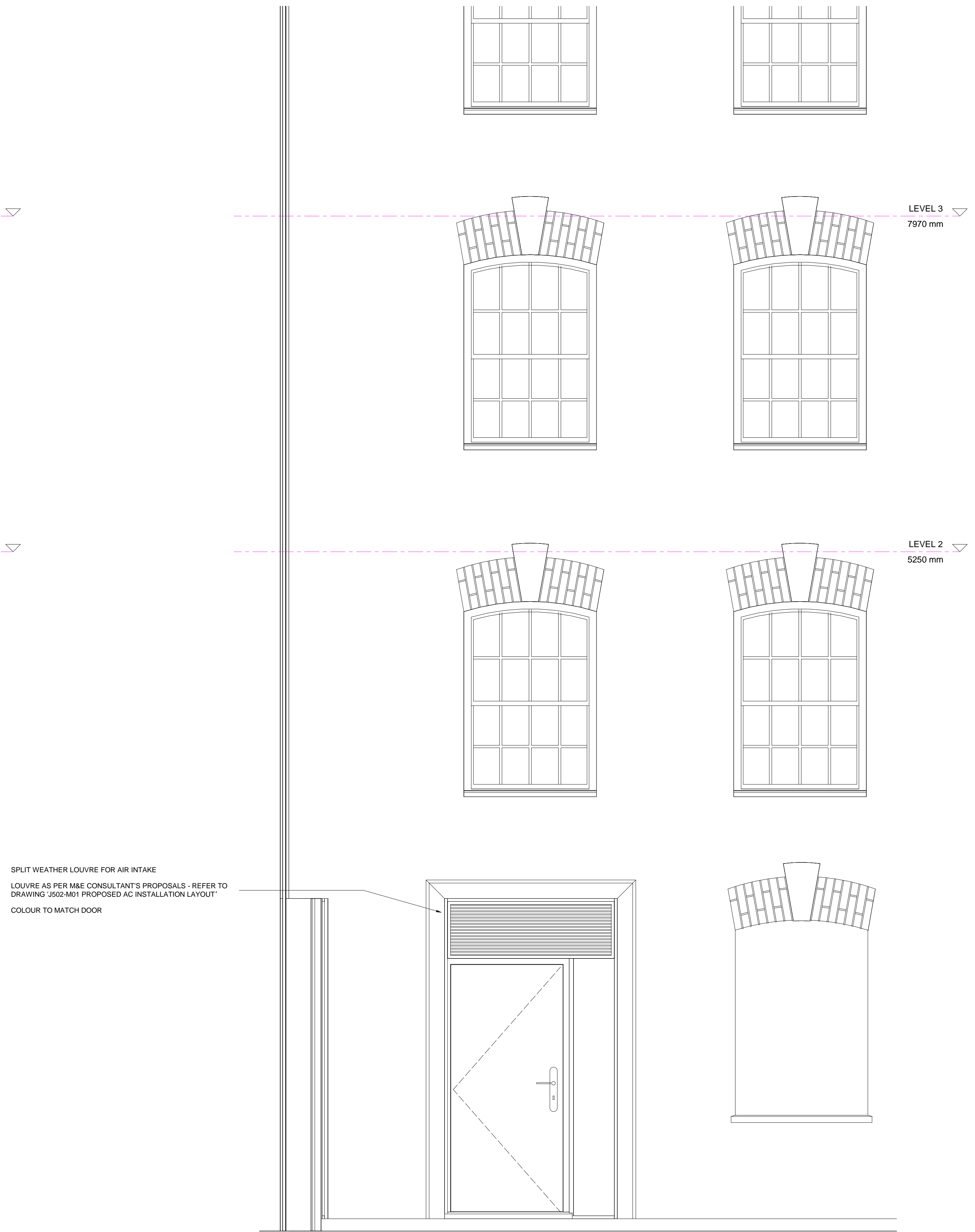
2 ELEVATION PROPOSED MAIN ENTRANCE