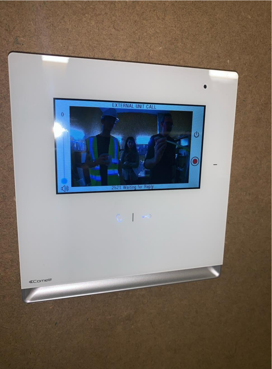
Users standing using the access panel