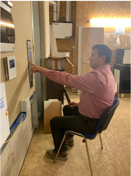
User sitting in wheelchair using access panel