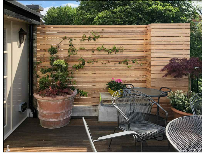
Photographic precedent of screening

Proposed Screening Diagram 1:50 @ A4 & 1:25 @ A2