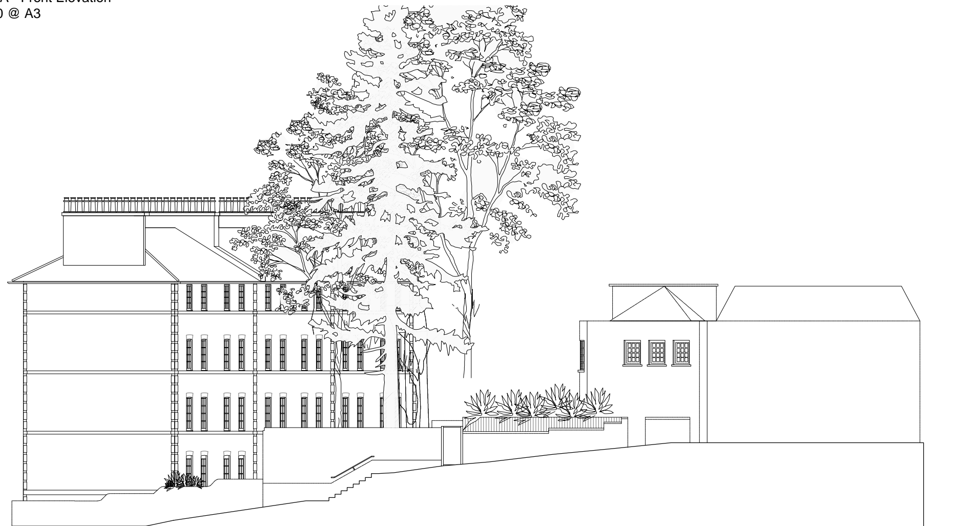
Existing Elevation A - Front Elevation 1:100 @ A3 & 1:200 @ A3