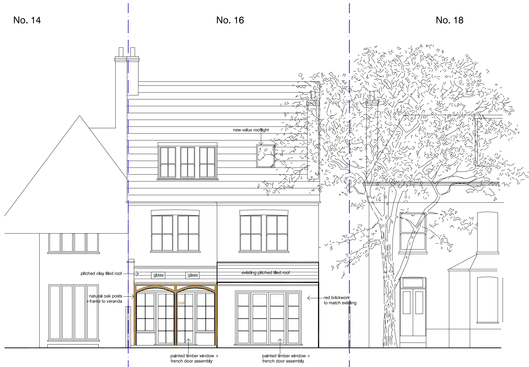
Rear Elevation as proposed