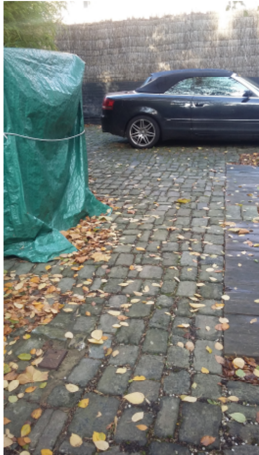
Hard standing at front of building