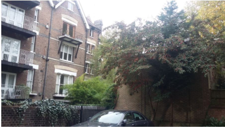
View from rear car park at No. 62 Fitzjohns Avenue