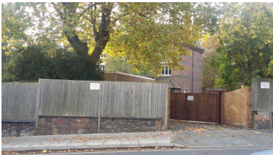
View from rear (Akenside Road)