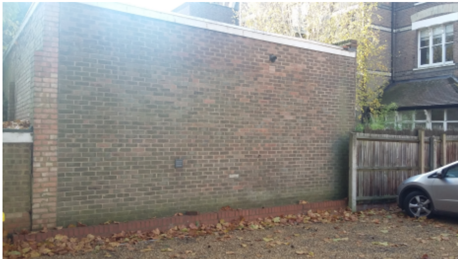
View from car park to side (Medresco House)