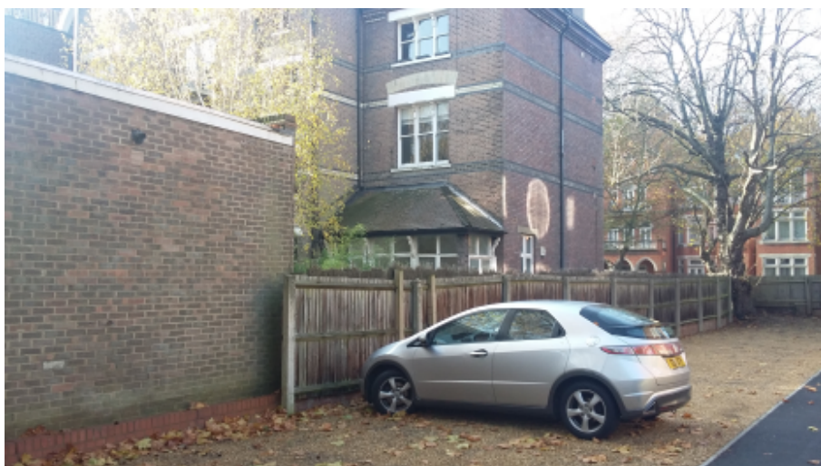
View from car park to side (Medresco House)