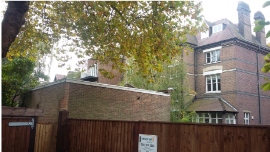
View from rear (Akenside Road)