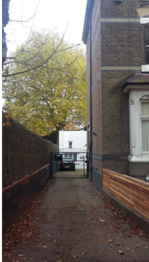
Views from driveway at side of No. 64