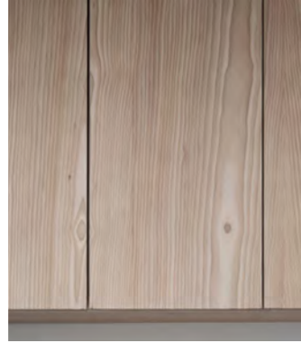
A Naturally Finished Timber