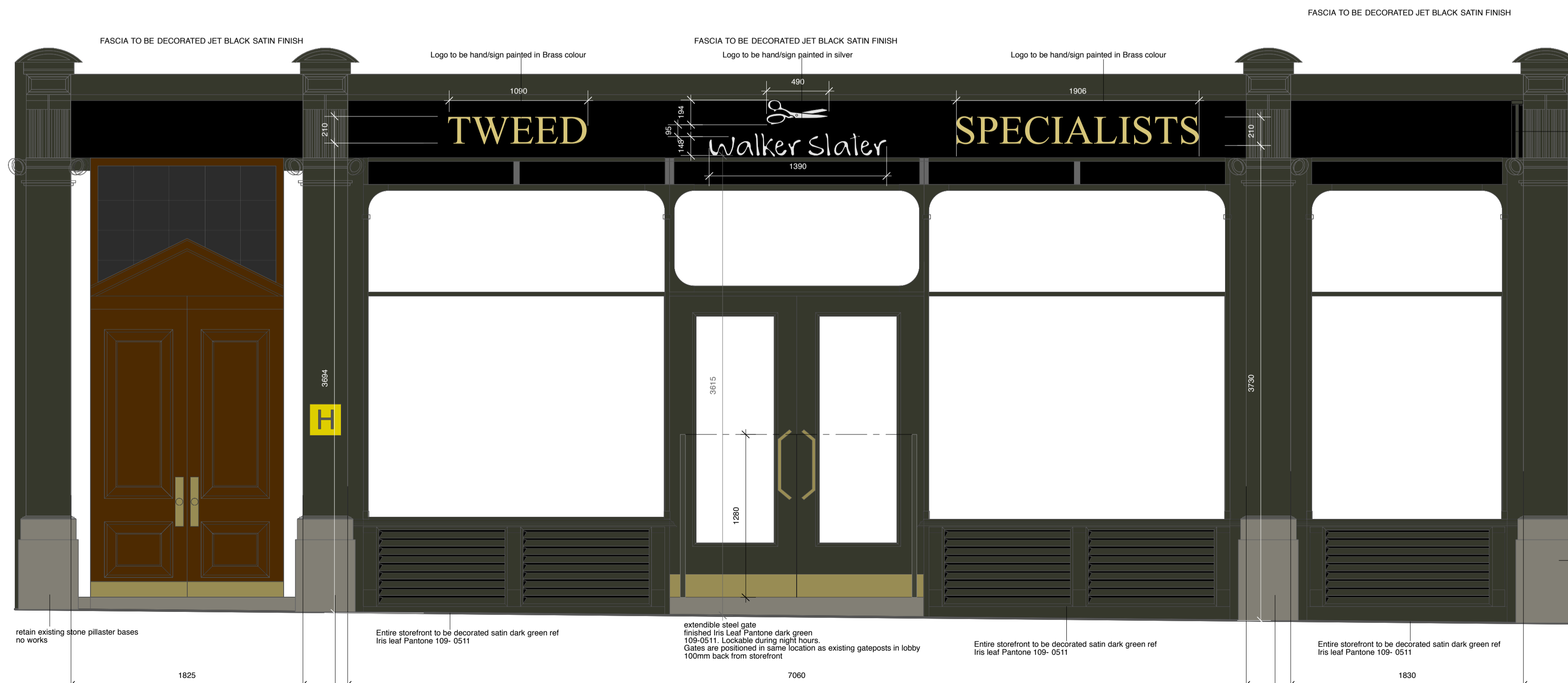
Proposed storefront elevation i