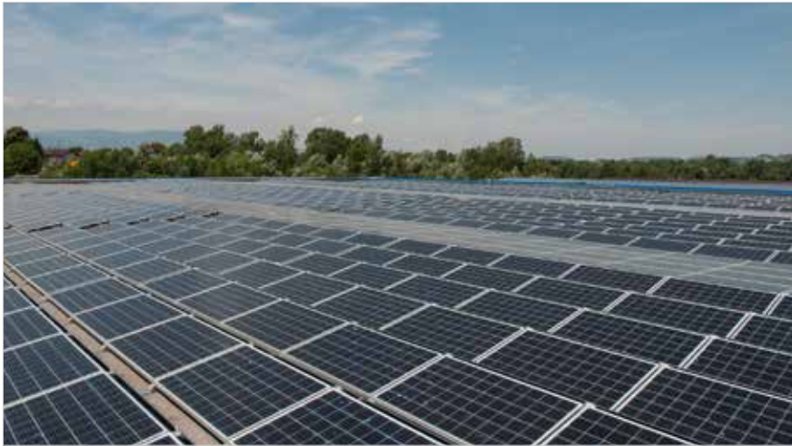
Slovenia Installation: 150 kW | S-Dome System