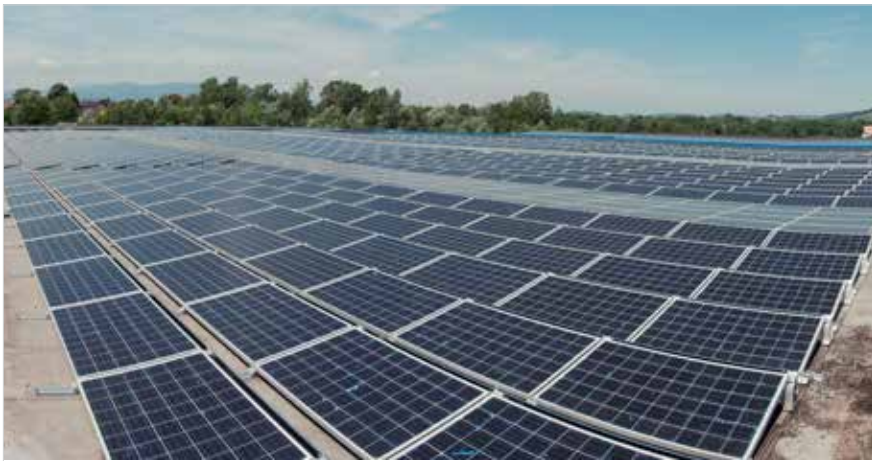
Slovenia Installation: 150 kW | S-Dome System