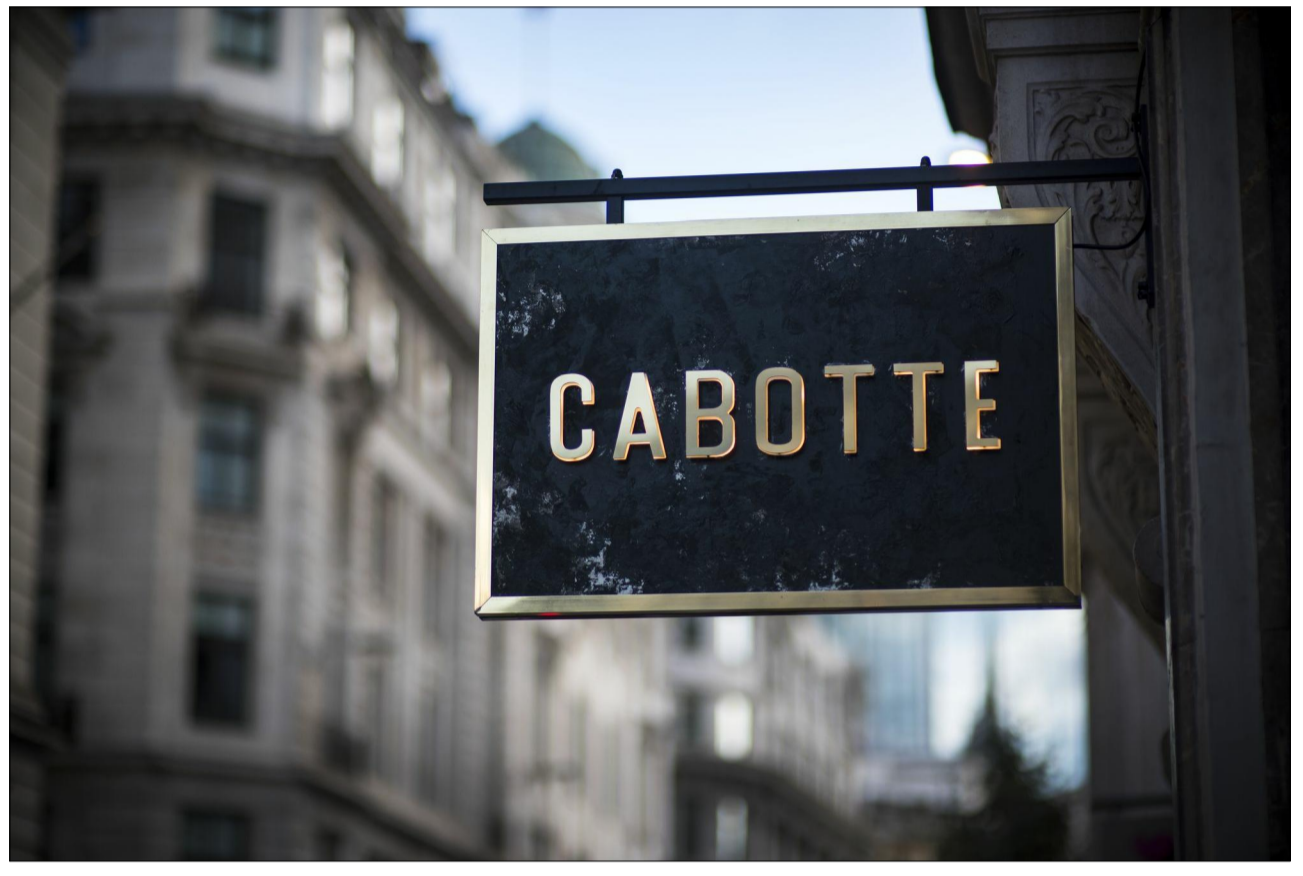
2 Blade Sign reference Image Scale: 1:5 @ A3

This drawing is the property of Rosendale Design. Copyright is reserved to them and the drawing is issued on the condition that it is not copied, either wholly or in part, without the written consent of Rosendale Design.